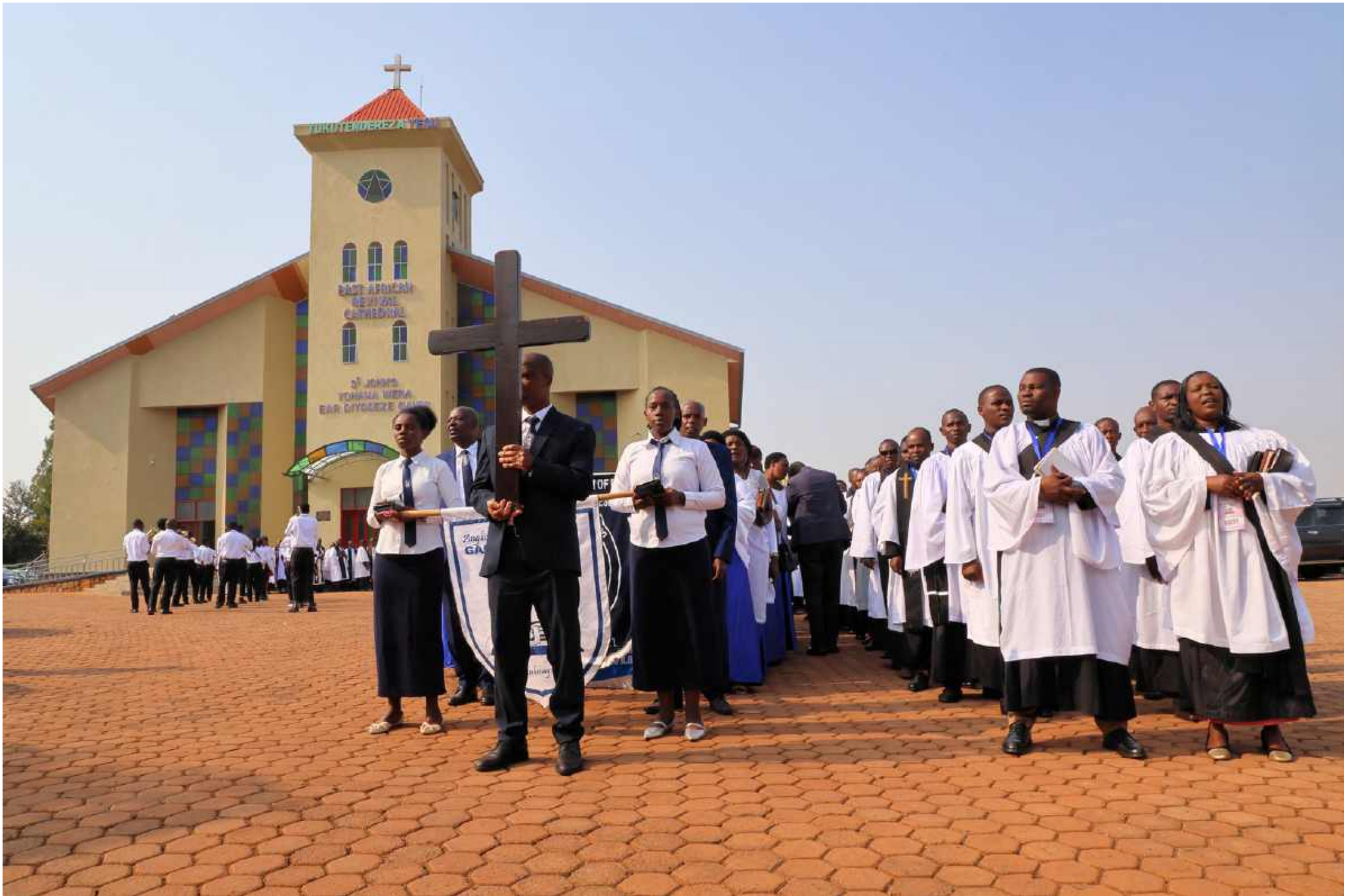
Celebrations in Gahini to mark 100 years of the Anglican Church in Rwanda.