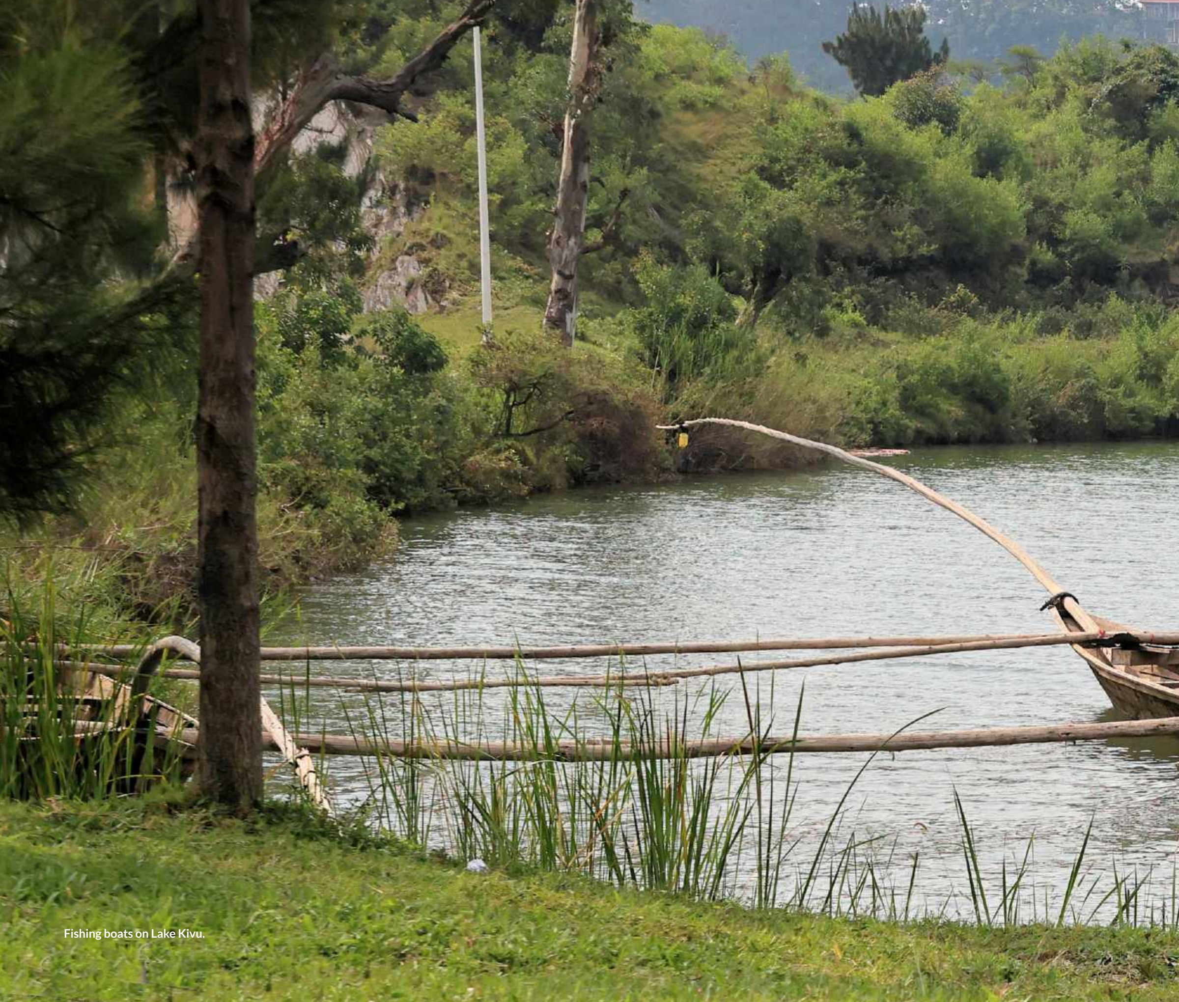
Fishing boats on Lake Kivu.