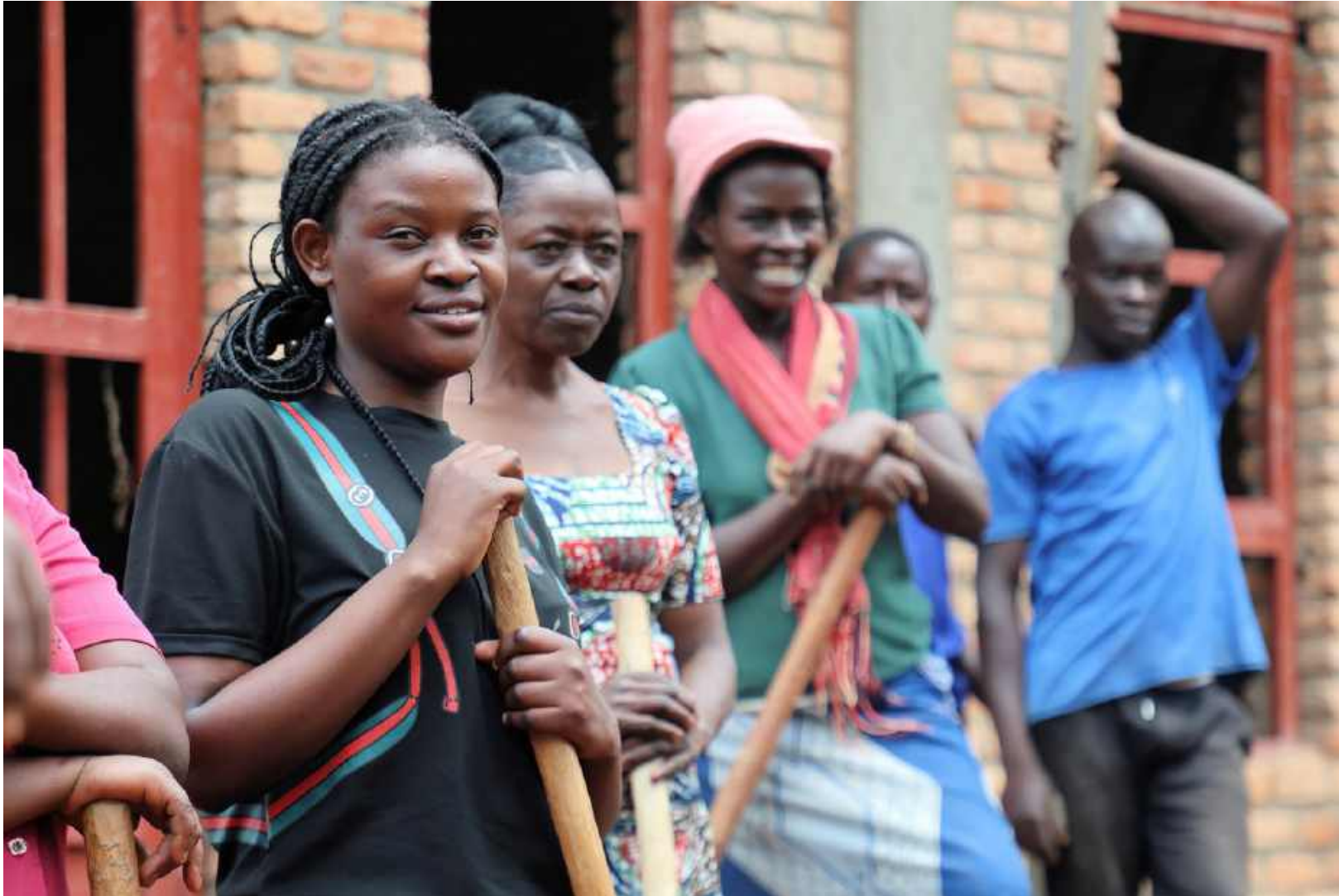
Building a church in the Congo-Nile parish, Karongi.