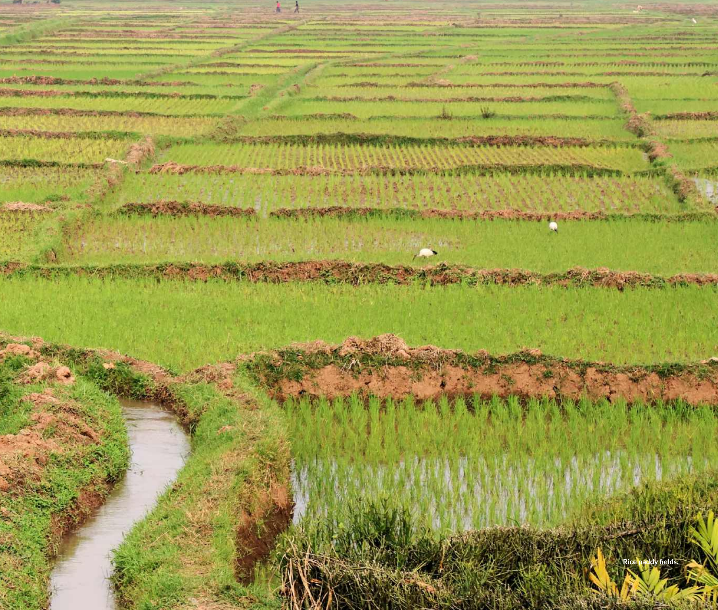
Rice paddy fields.