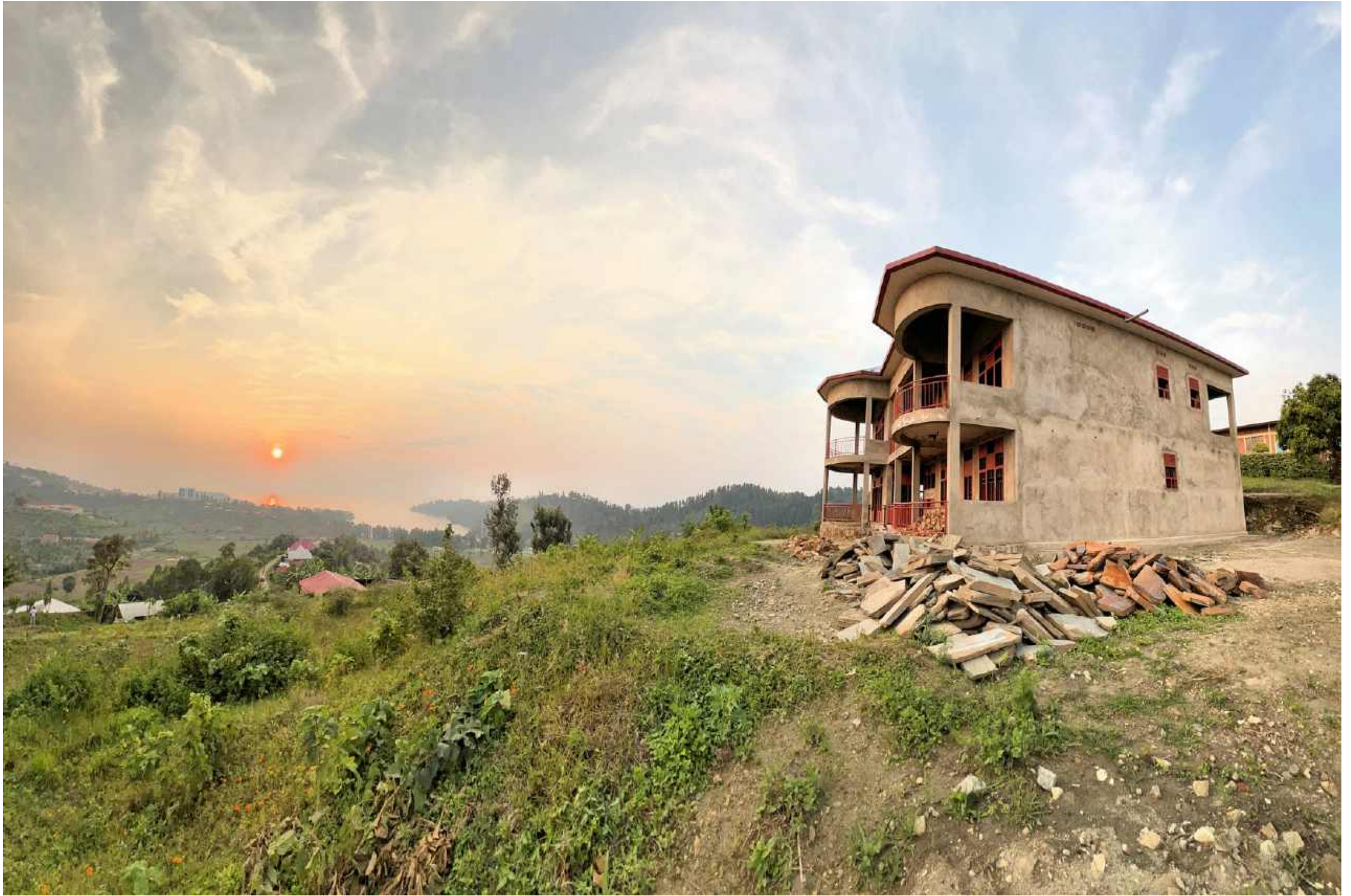
The Karongi Diocese guest house under construction with Lake Kivu in the background.