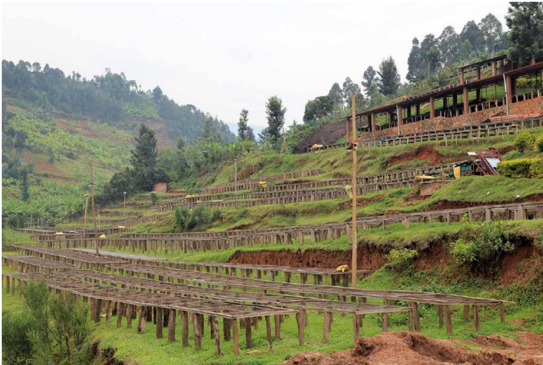
A traditional Rwandan beehive (opposite). Above: a coffee-washing station - coffee is one of Rwanda's biggest exports.