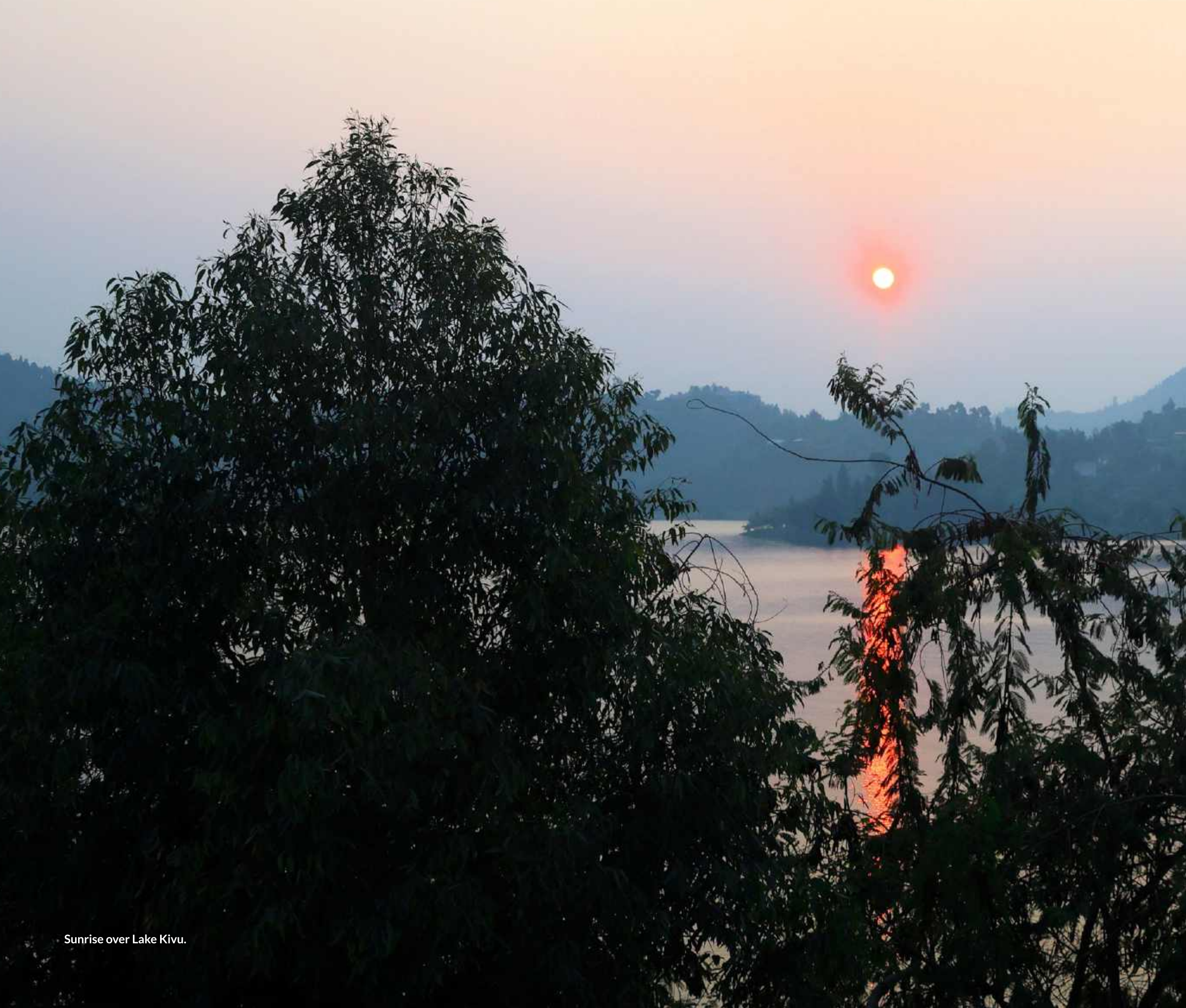
Sunrise over Lake Kivu.