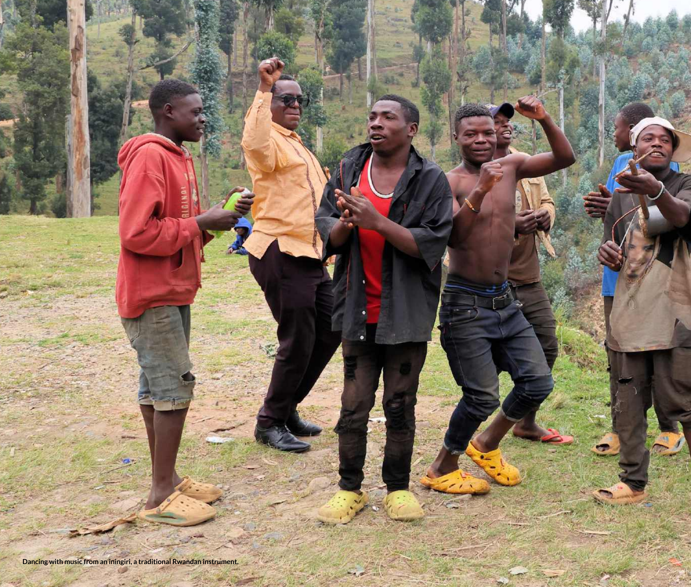
Dancing with music from an iningiri, a traditional Rwandan instrument.