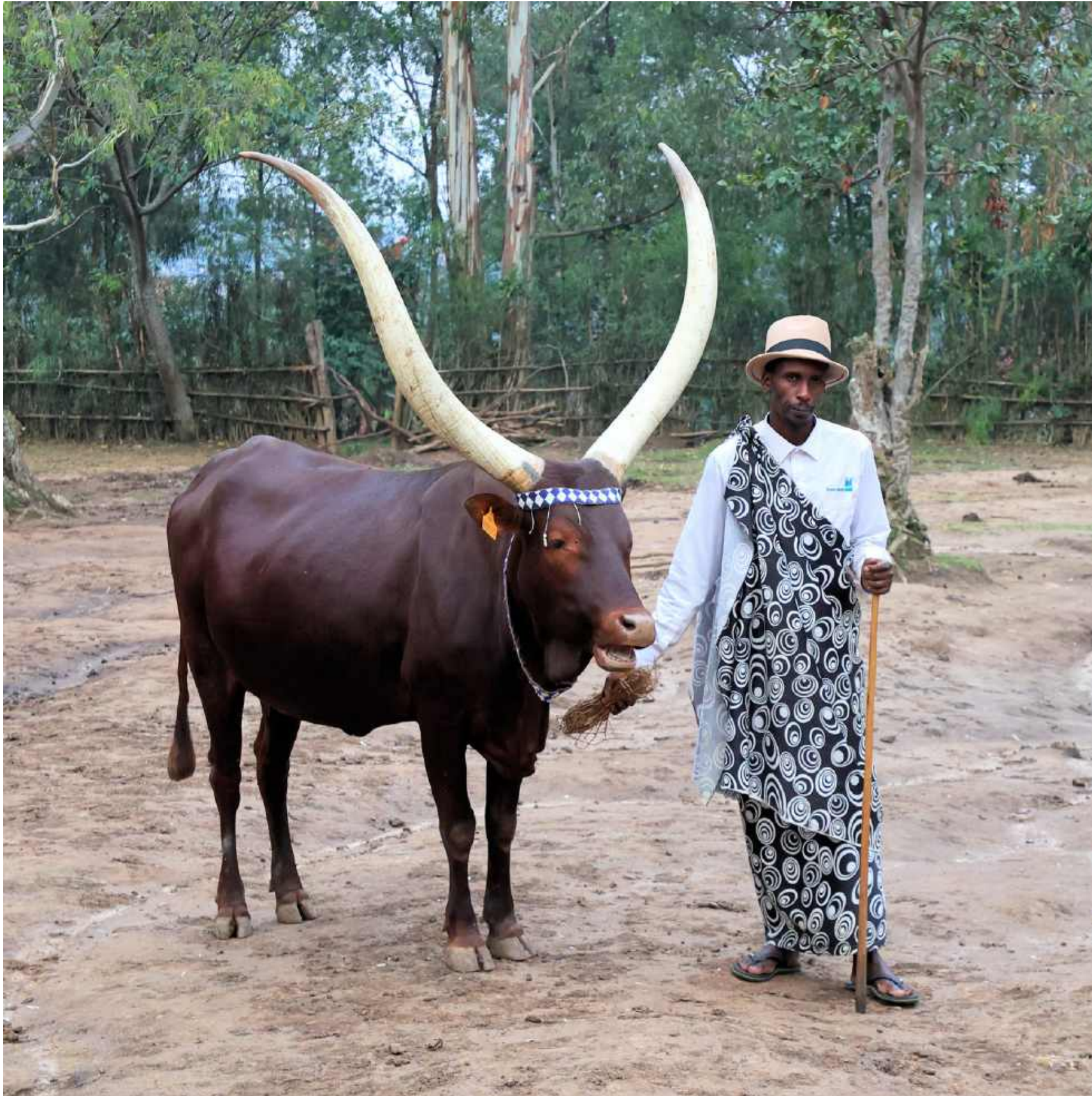
The King's Palace Museum, Nyanza, with long-horned Inyambo cattle and keeper, and the ceiling of the replica palace.