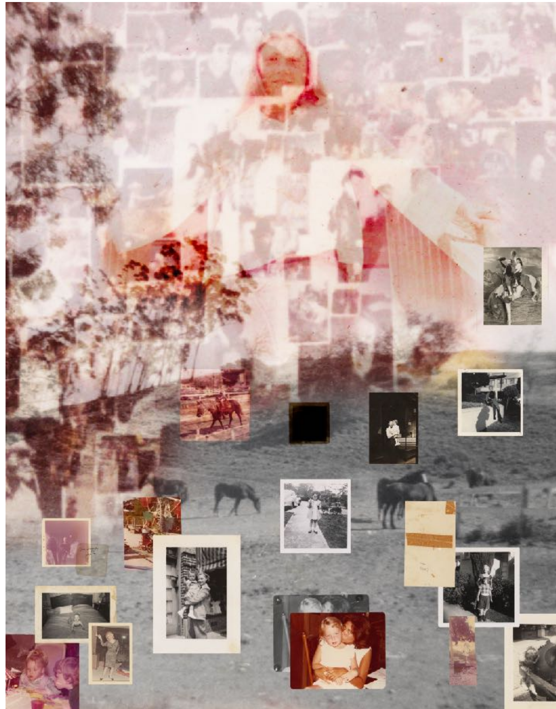
8. 2020, Broad Street, 3, 2020, 11"x14", Archival Color Print