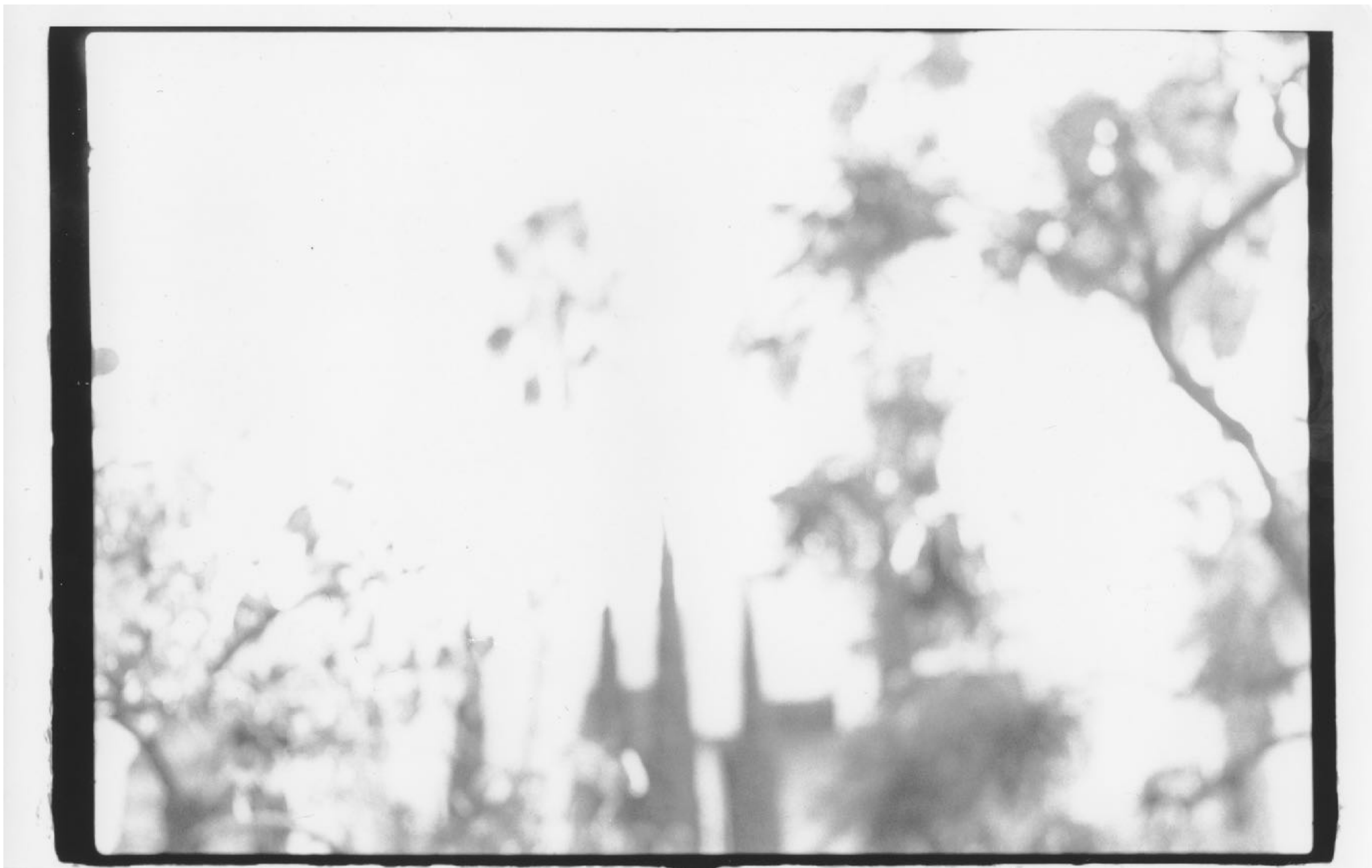
7. 2020, Untitled, Los Angeles, 7"X5", Silver Gelatin Print