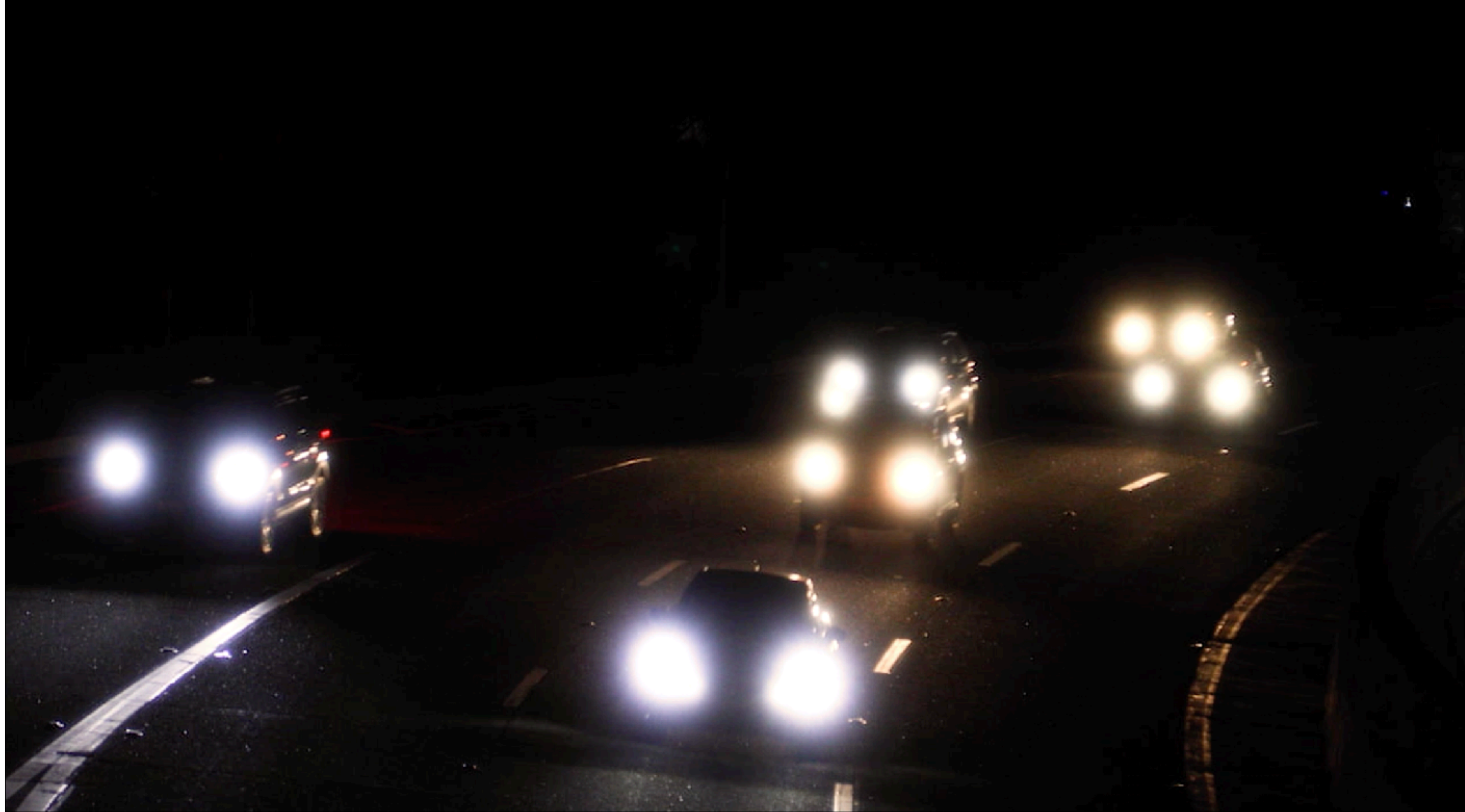
9. 2023, Untitled, Mood Reel from Calling 323 Documentary, 2:27 min. HD Video