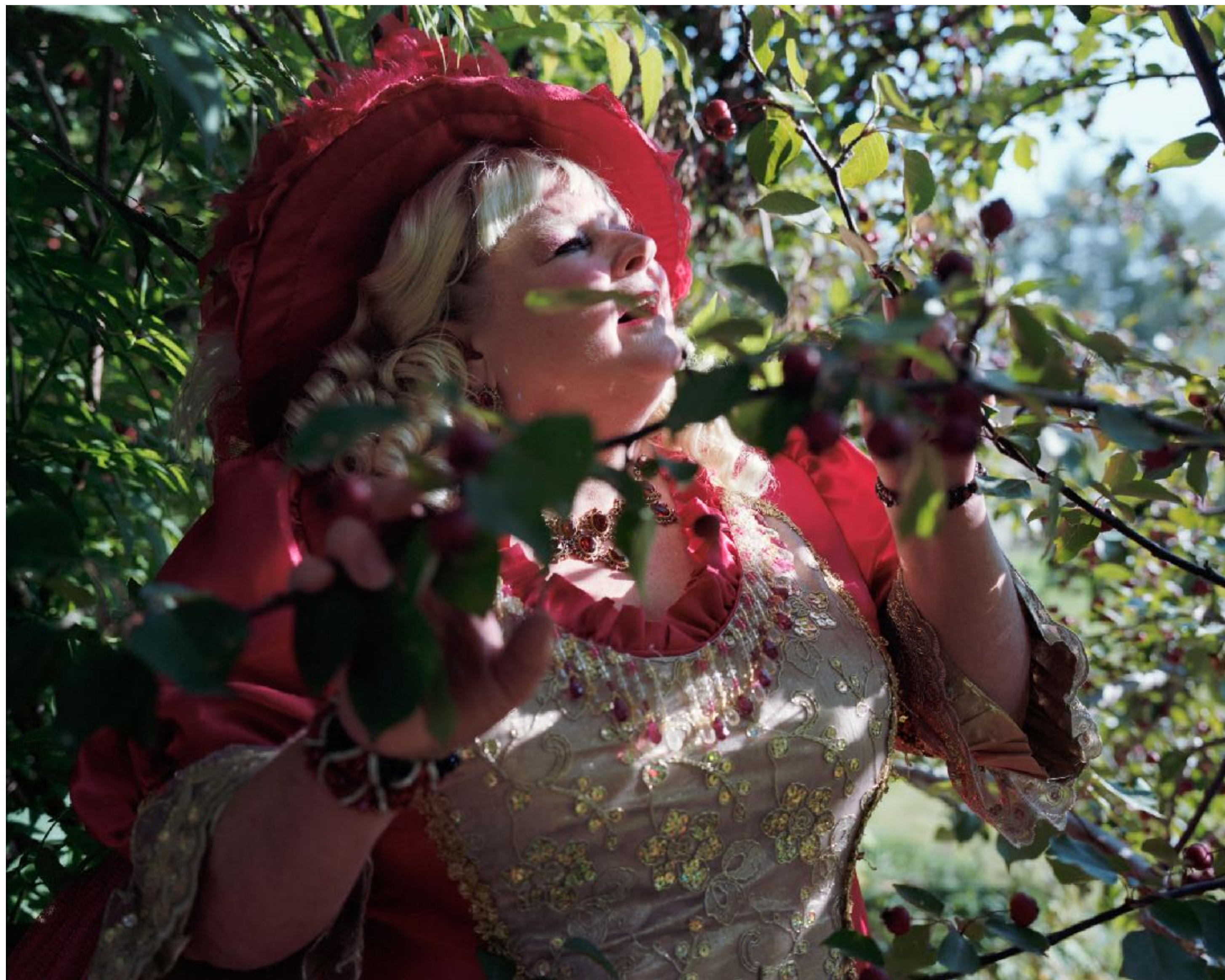
3. 2011, Morning Glory, 24"x30", Archival Color Print