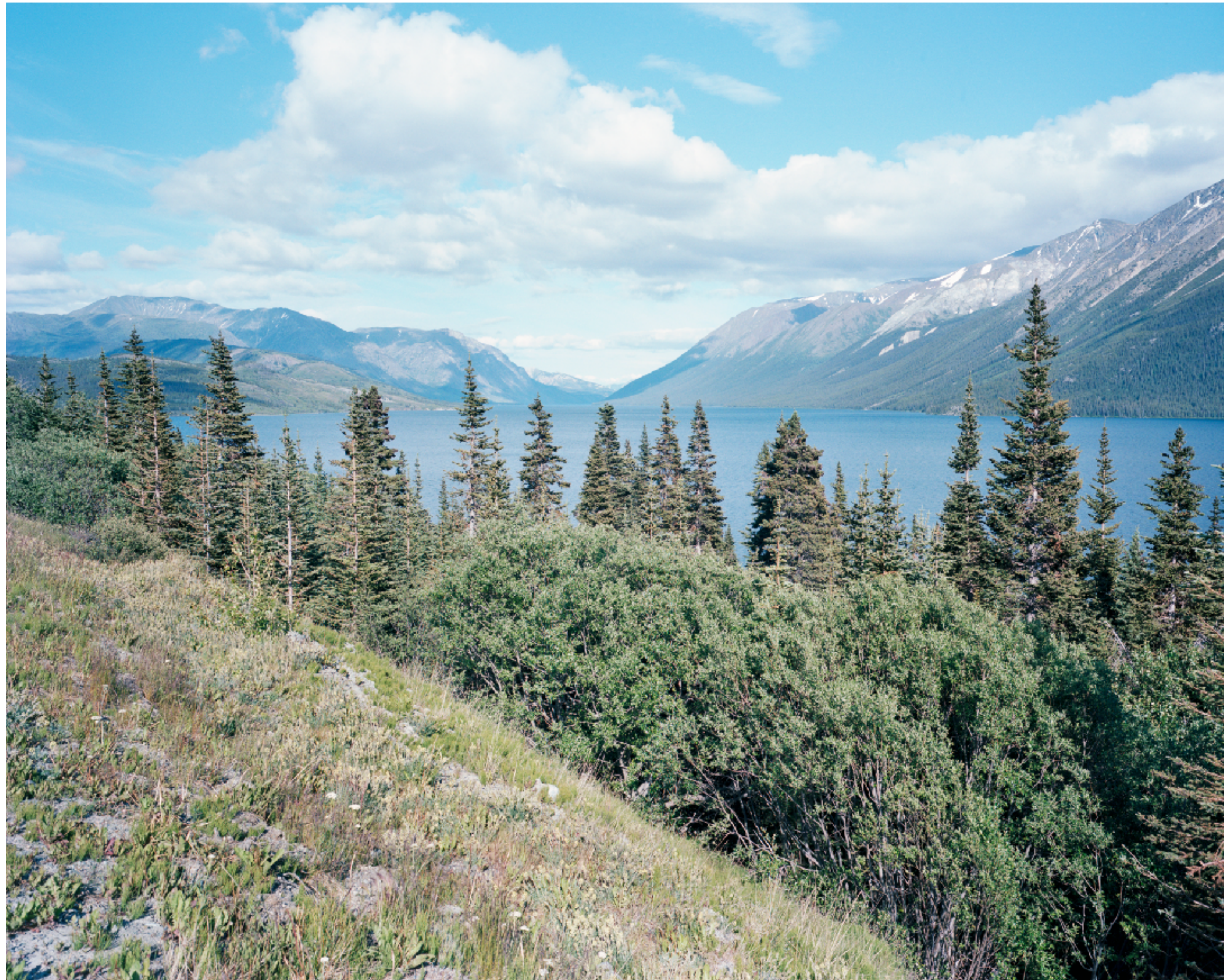
2. 2011, Untitled, 24"x30", Archival Color Print