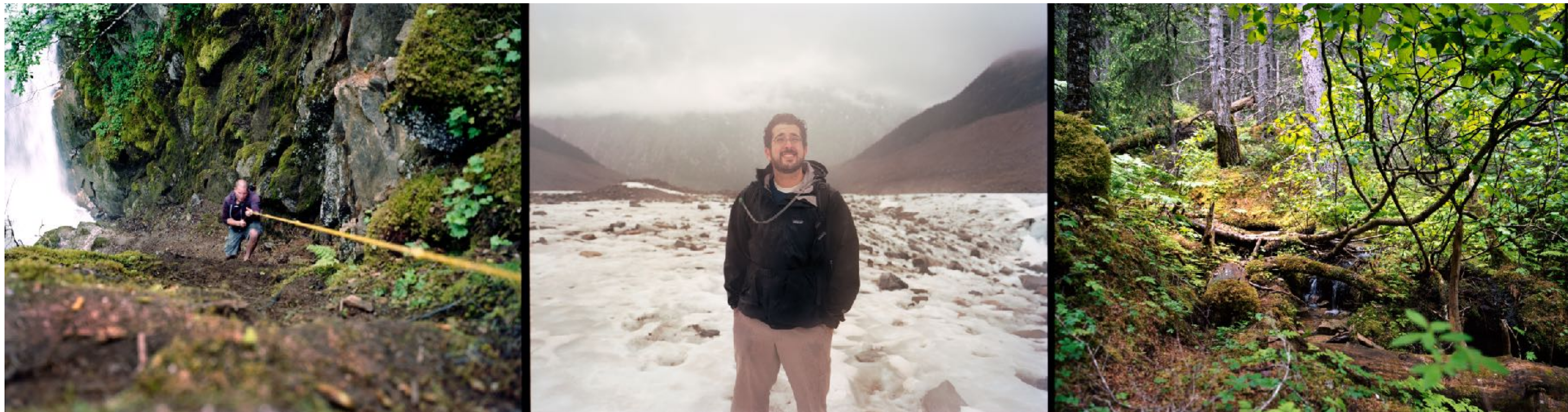
1. 2011, We try., 24"x92", Archival Color Print