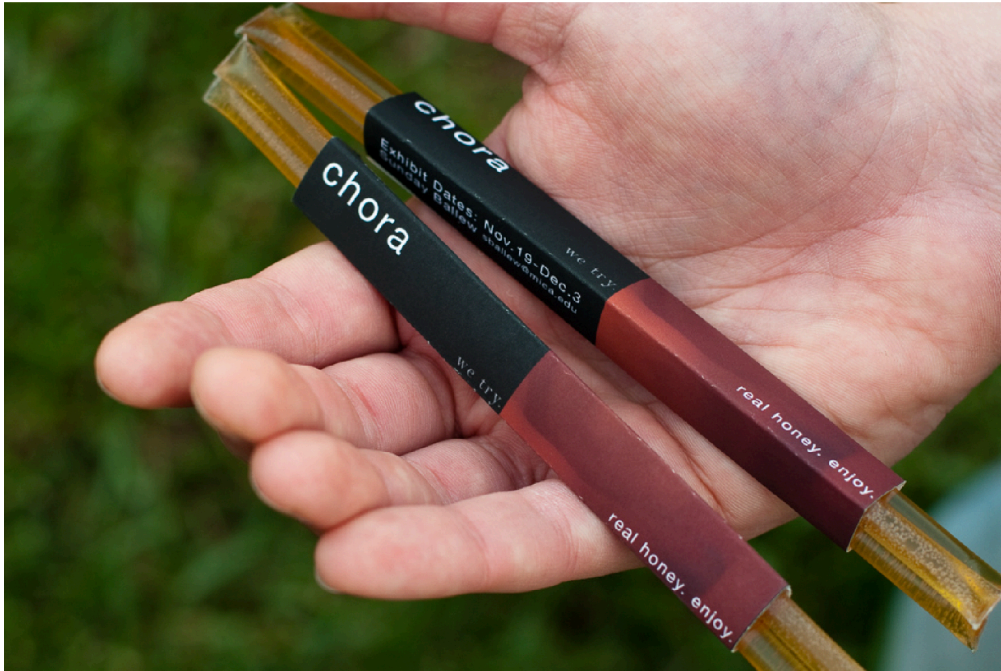
4. 2013, real honey. enjoy., Takeaway - Honey Sticks, Archival Printed Paper Wrapping