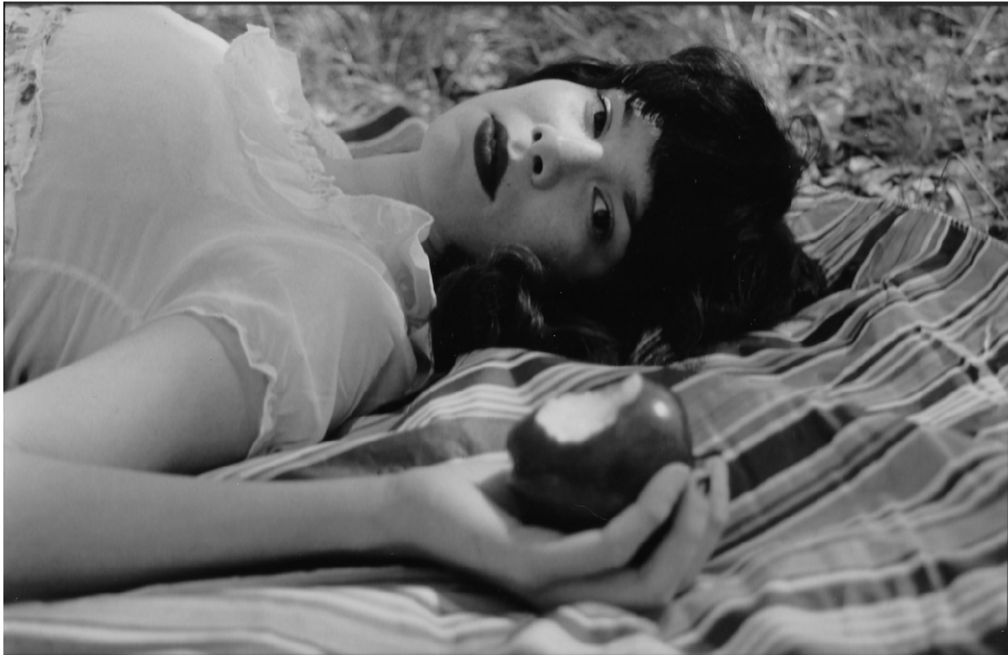
2. 2015, Silver Gelatin Print, 10"x8", Intermediate Level, Intermediate Photography (Darkroom II), Assignment: Ideas into Pictures