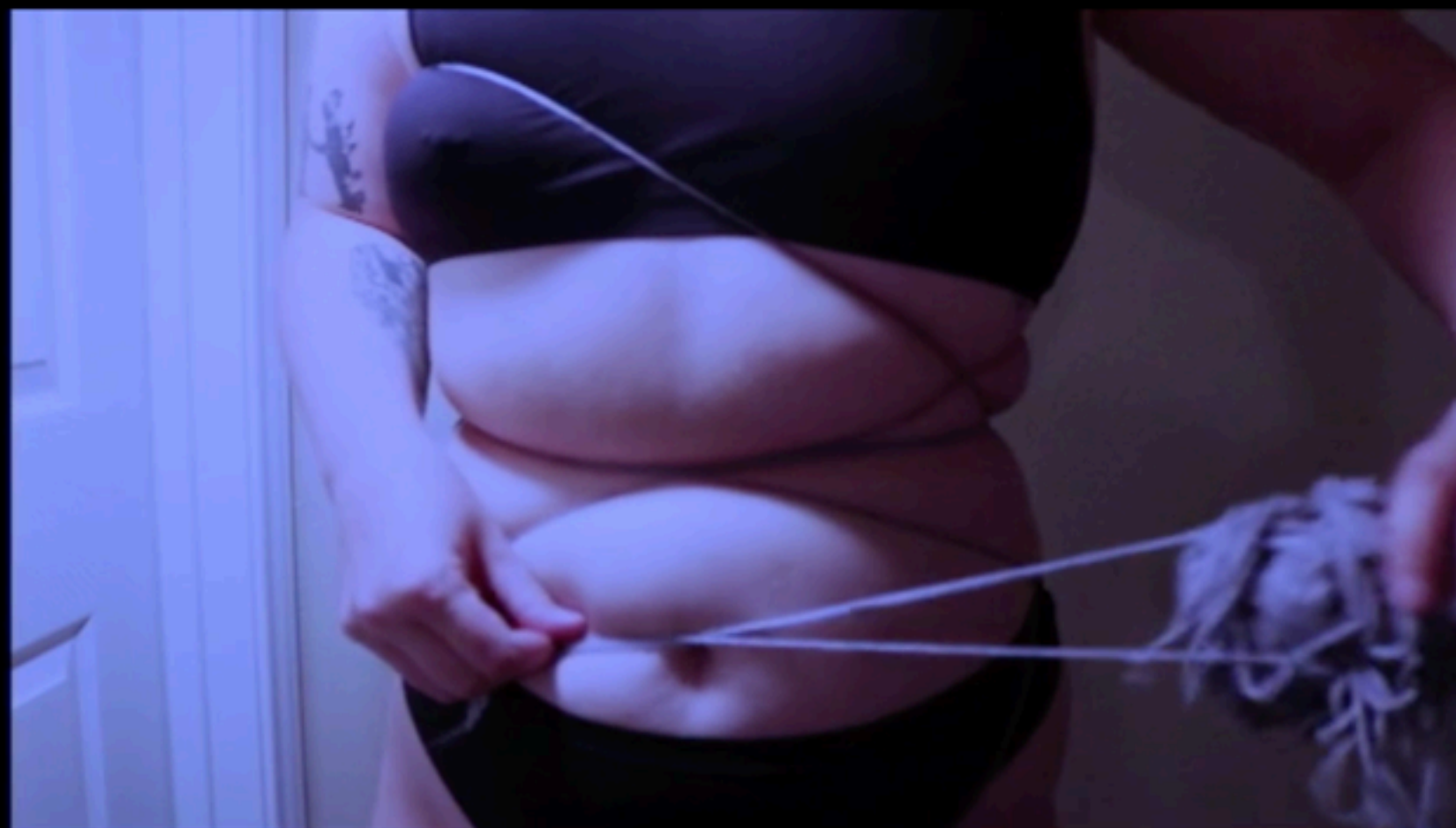
8. 2019, Video (still), Beginner Level, Digital Studio (An Adobe CC Class), Assignment: Action & the Body