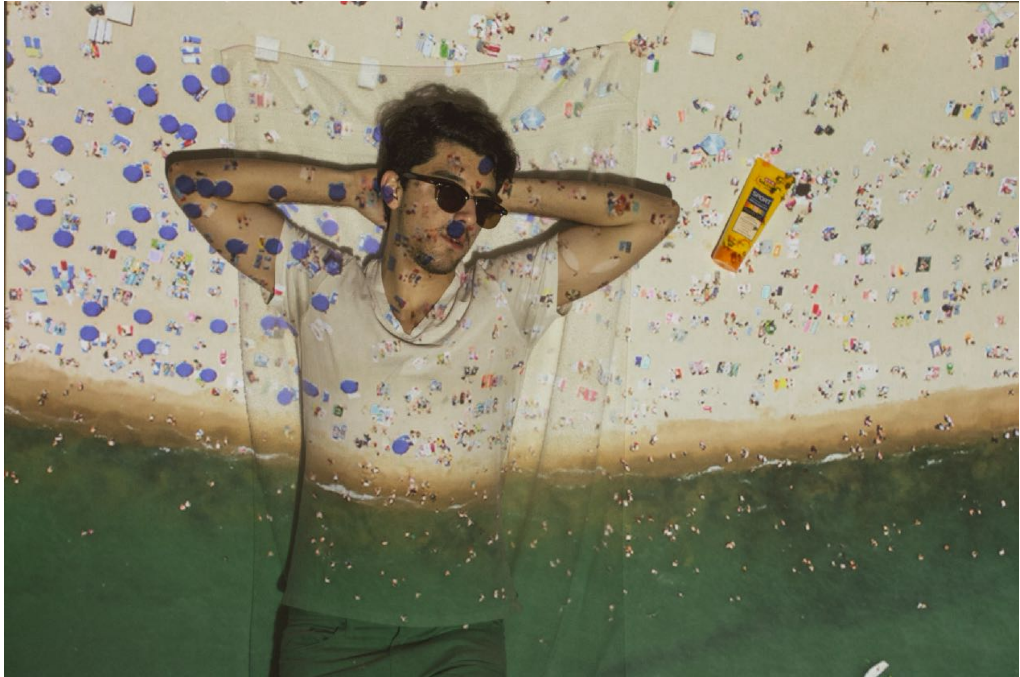
3. 2015, Digital File, 10"x8", Beginner Level, Art for Non-Art Majors: Photography, Assignment: Light & Abstraction