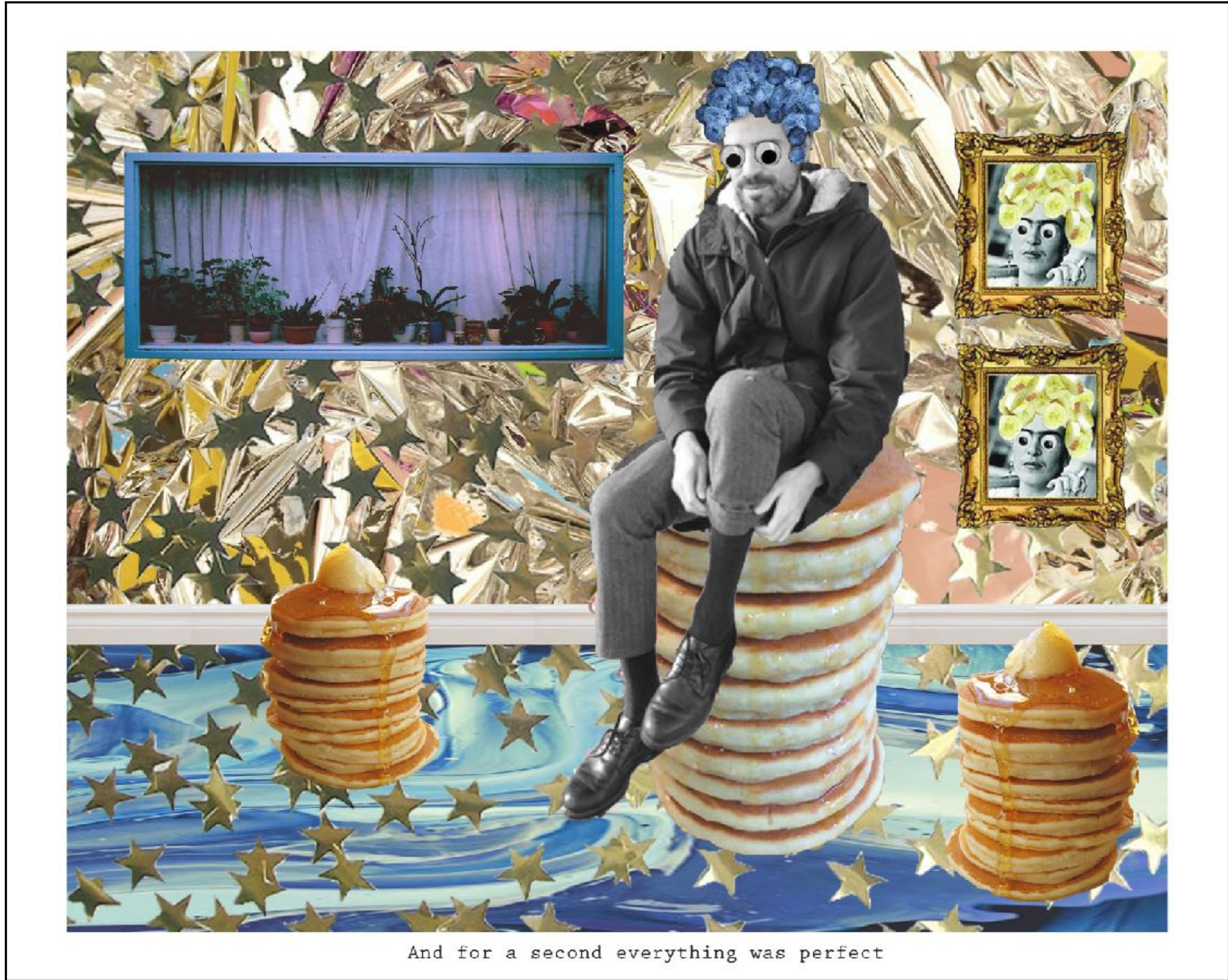
1. 2015, Digital File, 10"x8", Beginner Level, Basic Digital (Digital Photography 1), Assignment: Image and Text