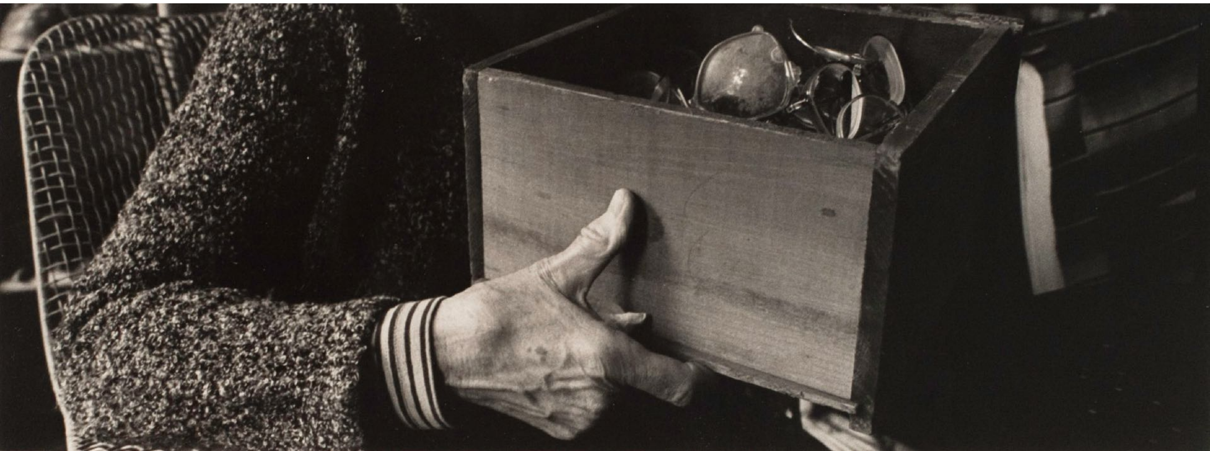
7. 2017, Silver Gelatin Print, 10"x4", Beginner Level, Photography I – B&W Darkroom, Final Open Assignment