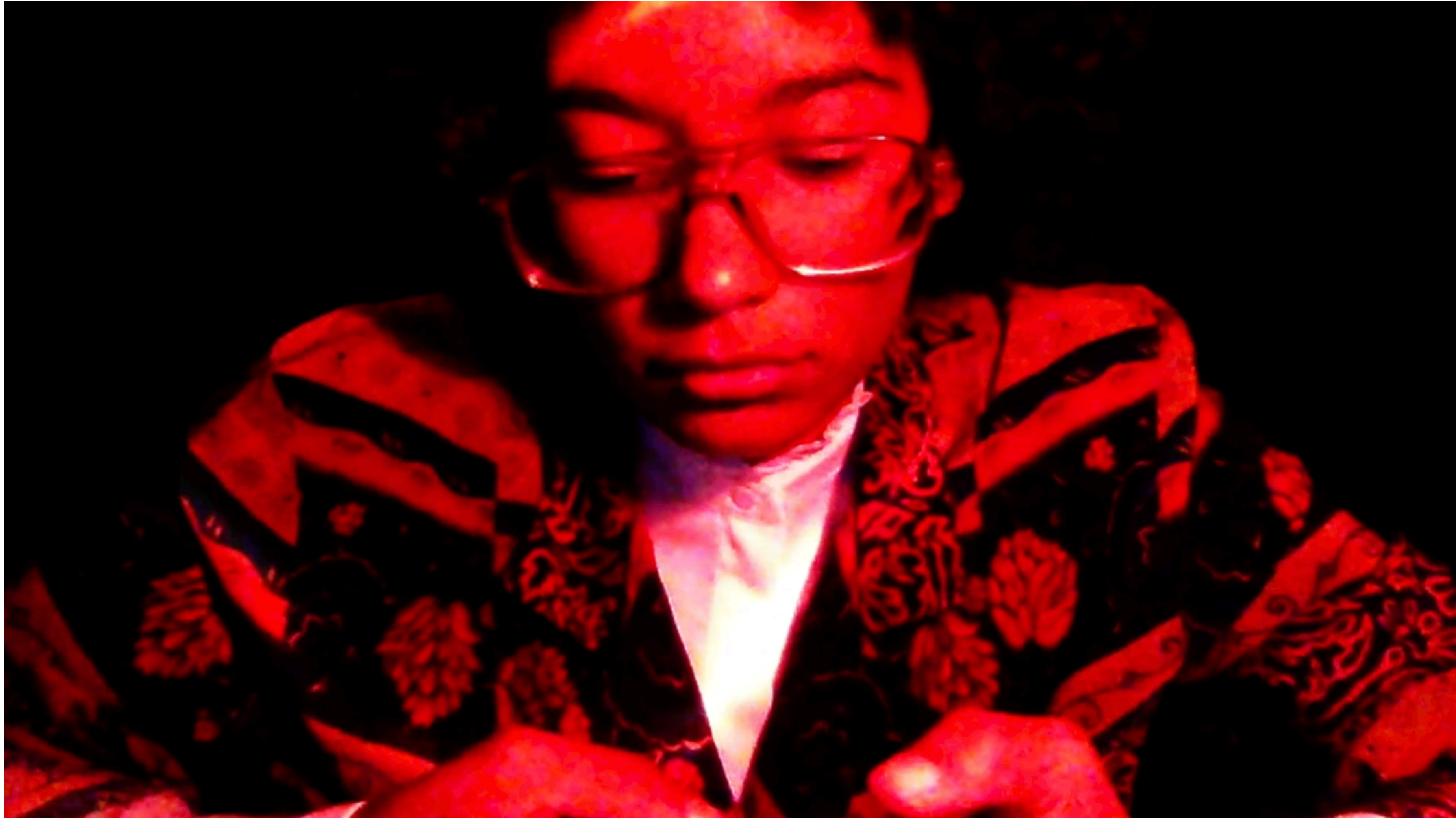
10. 2019, Video Still - 1 min video, Beginner Level, Digital Studio (An Adobe CC Class), Assignment: Action & the Body