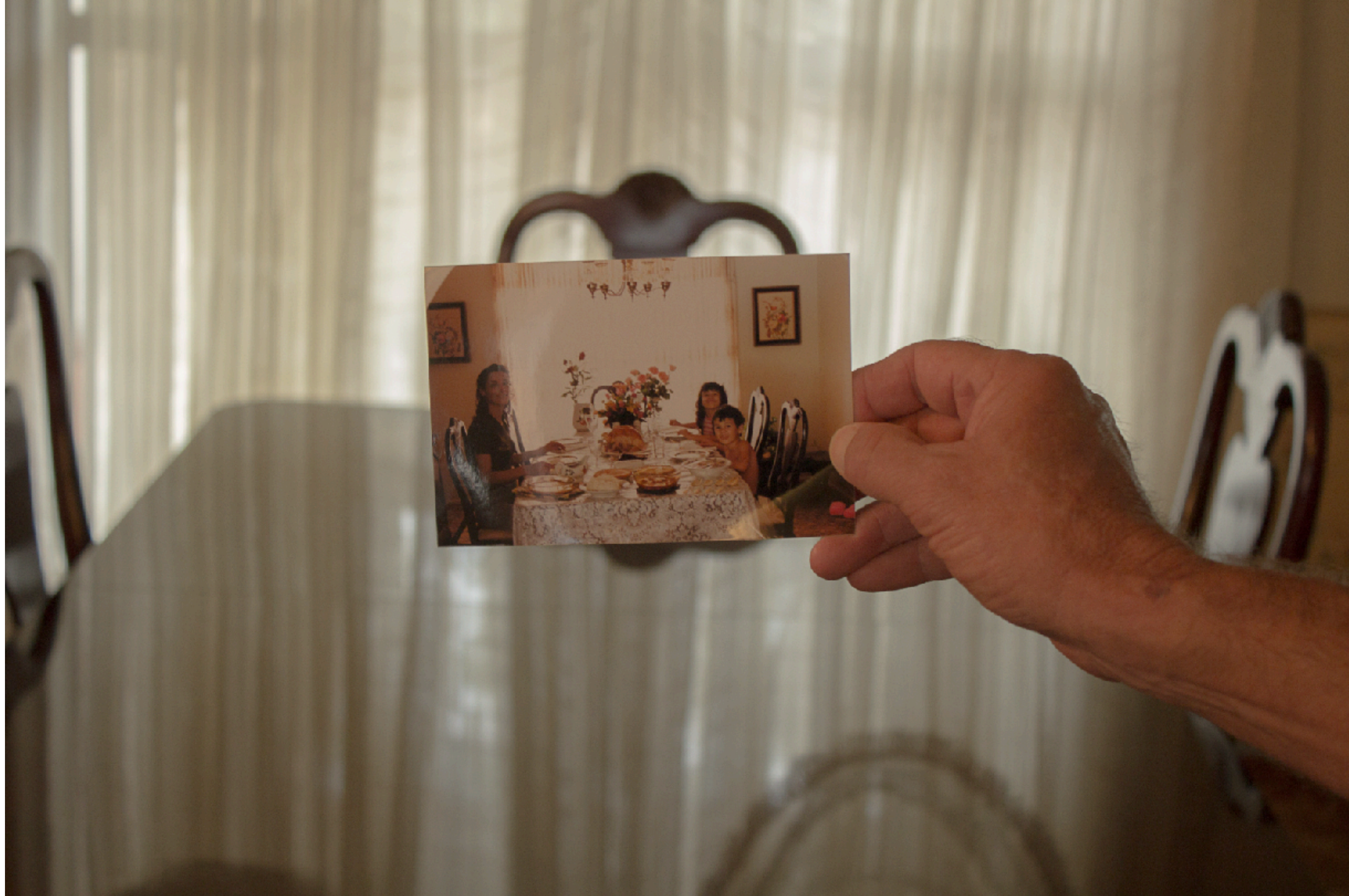
6. 2014, Digital Photobook - Detail, 10"X8", Beginner Level, Basic Digital (Digital Photography 1), Assignment: Lightroom Photobook