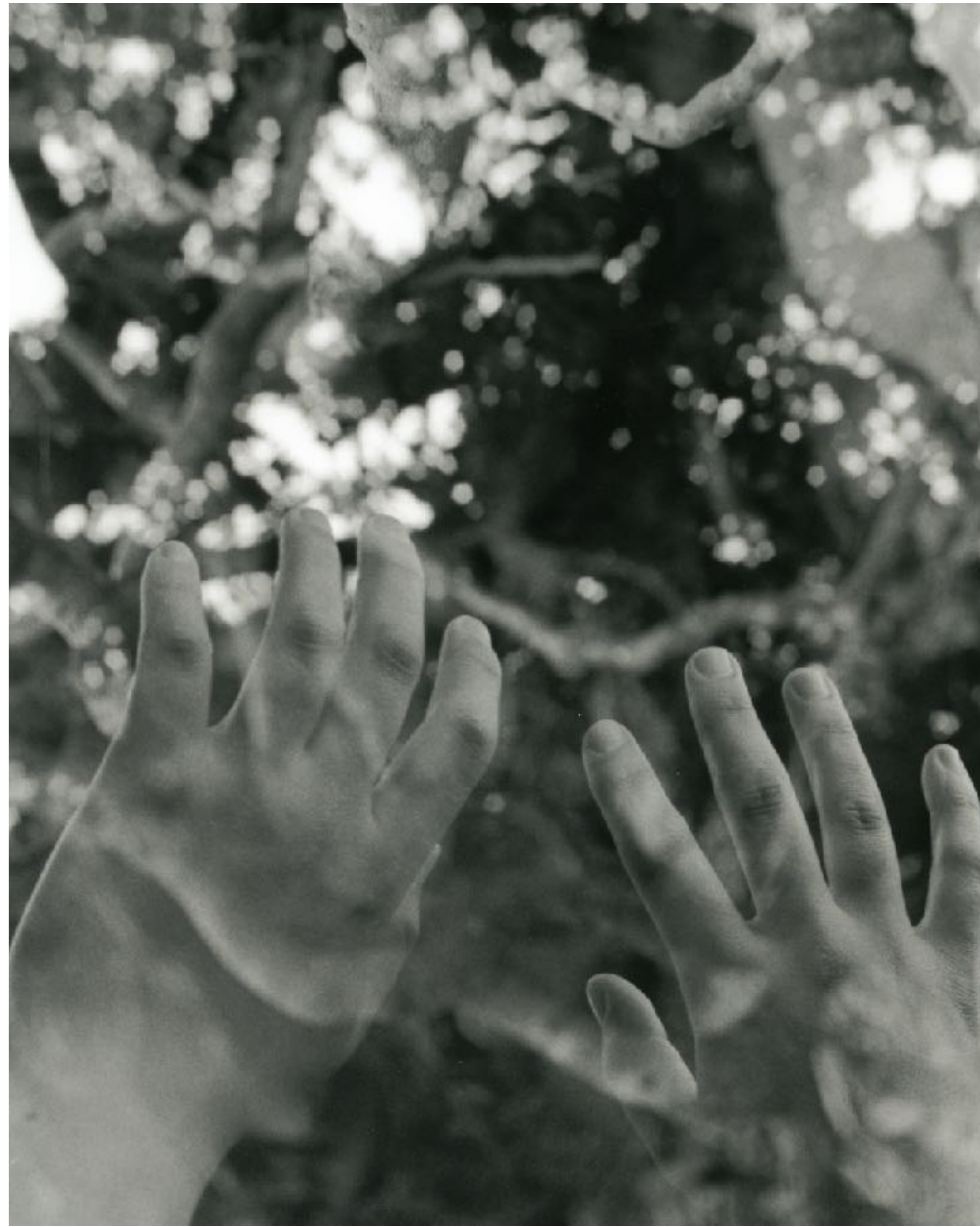
8. 2016, Silver Gelatin Print (Double Exposure Negative), 8"x10", Intermediate Photography (Darkroom II), Collaborative (between a school in Tennessee and my school in Texas) Double Exposure Assignment