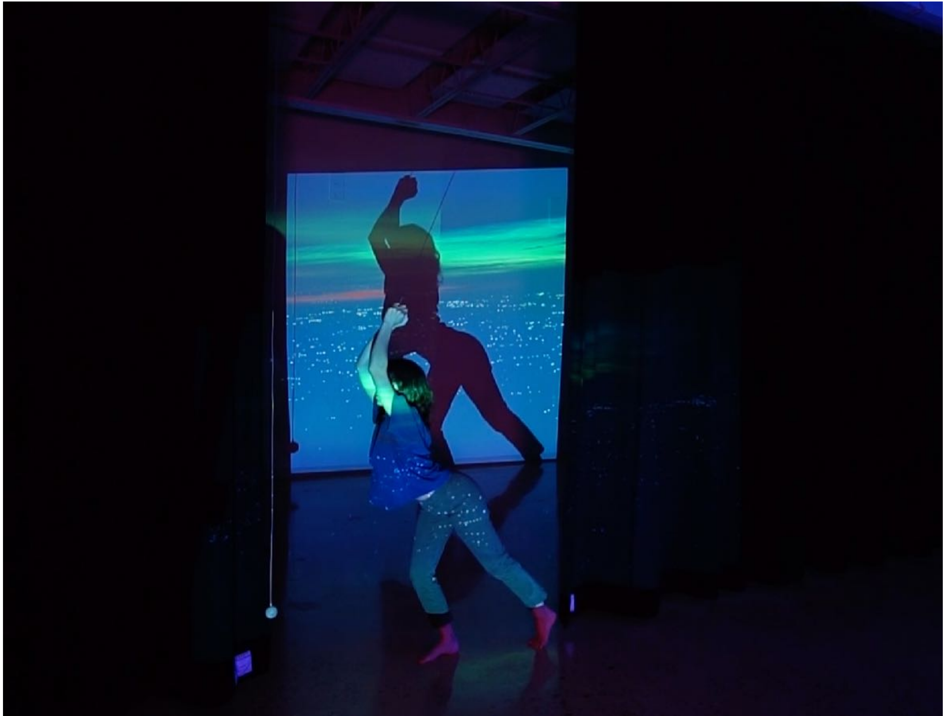
9. 2020, Still from Multimedia Performance, Advanced Level, Advanced Digital Photography (Digital 2), Final Open Assignment