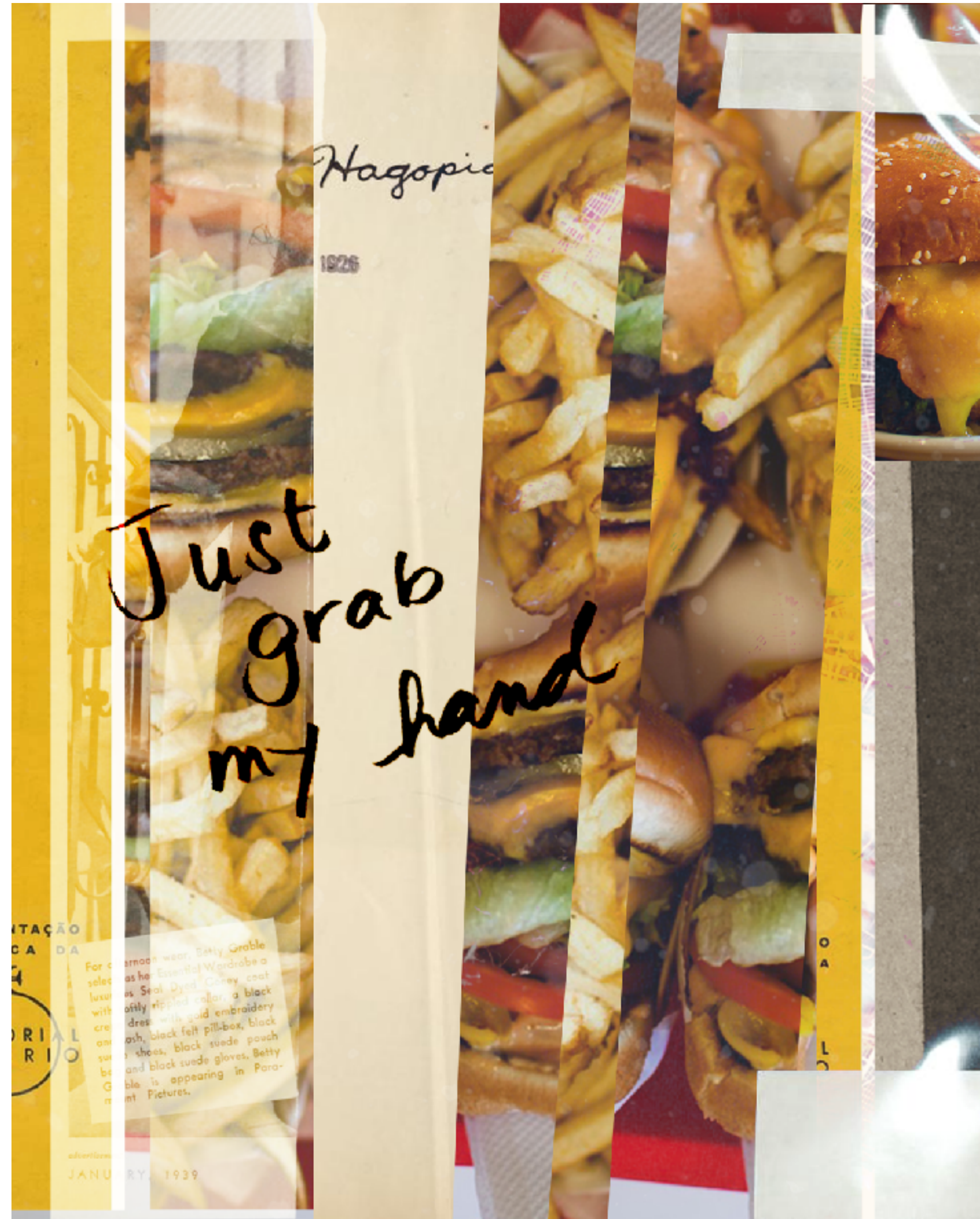
5. 2016, Digital File, Beginner Level, Basic Digital (Digital Photography 1), Assignment: Image and Text