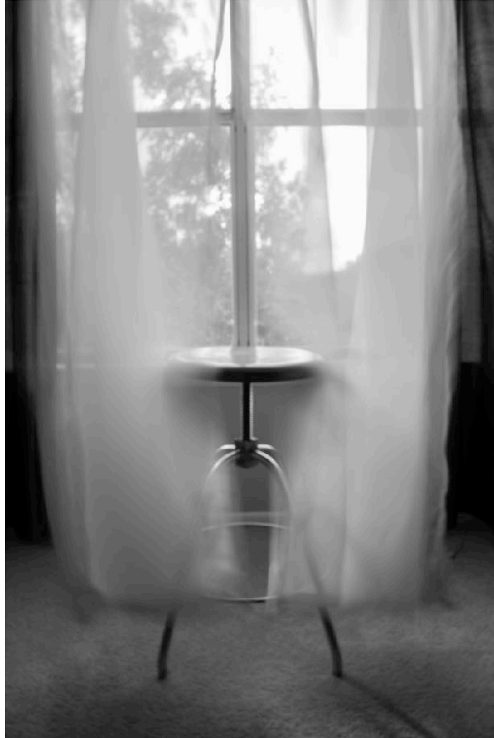
4. 2015, Digital File, Beginner Level, Art for Non-Art Majors: Photography, Assignment: Motion & Depth of Field