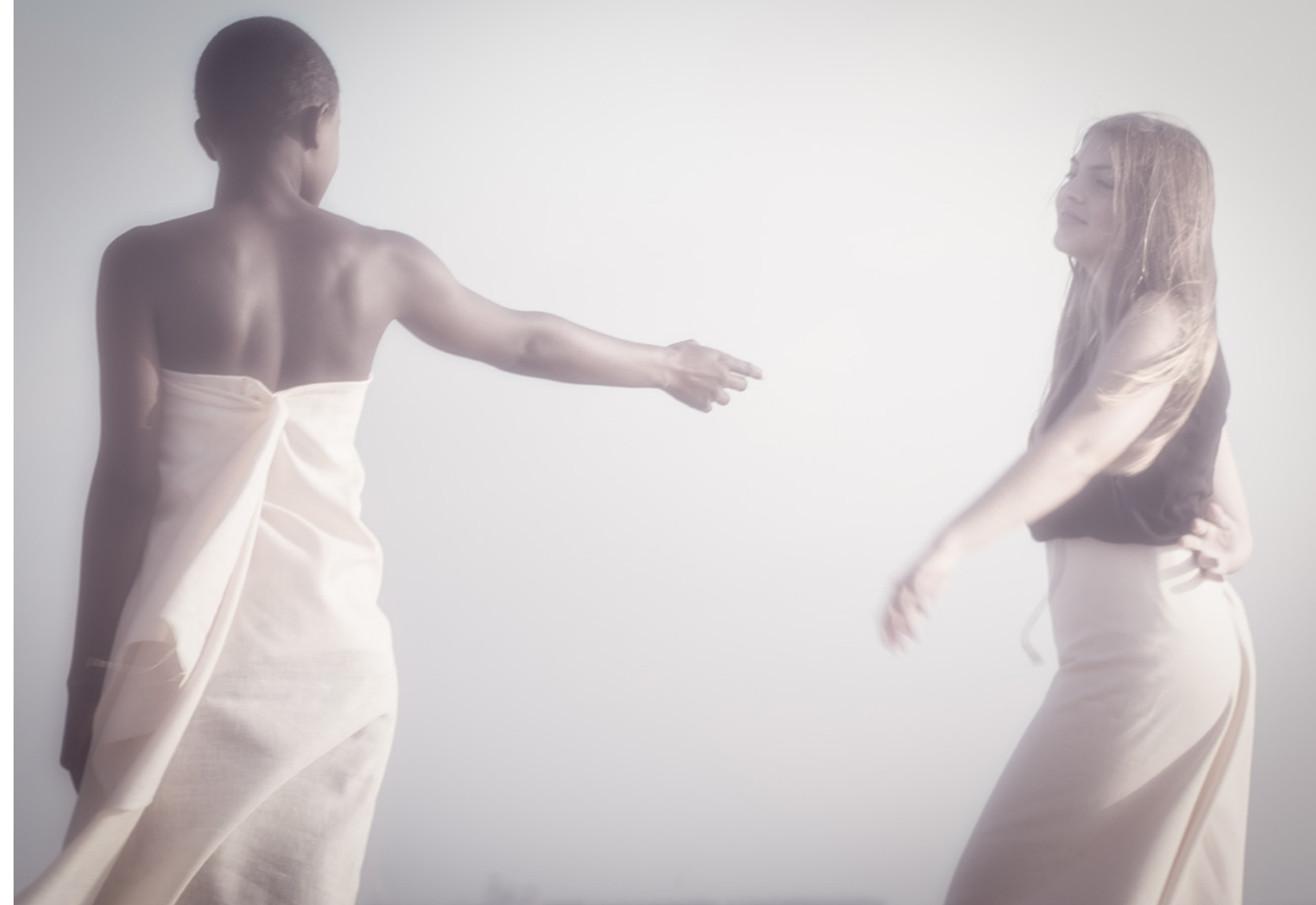
Iris Debelder © All rights reserved.