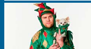
PIFF THE MAGIC DRAGON