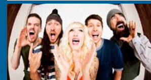
WALK OF THE EARTH