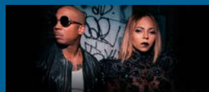
ASHANTI & JA RULE