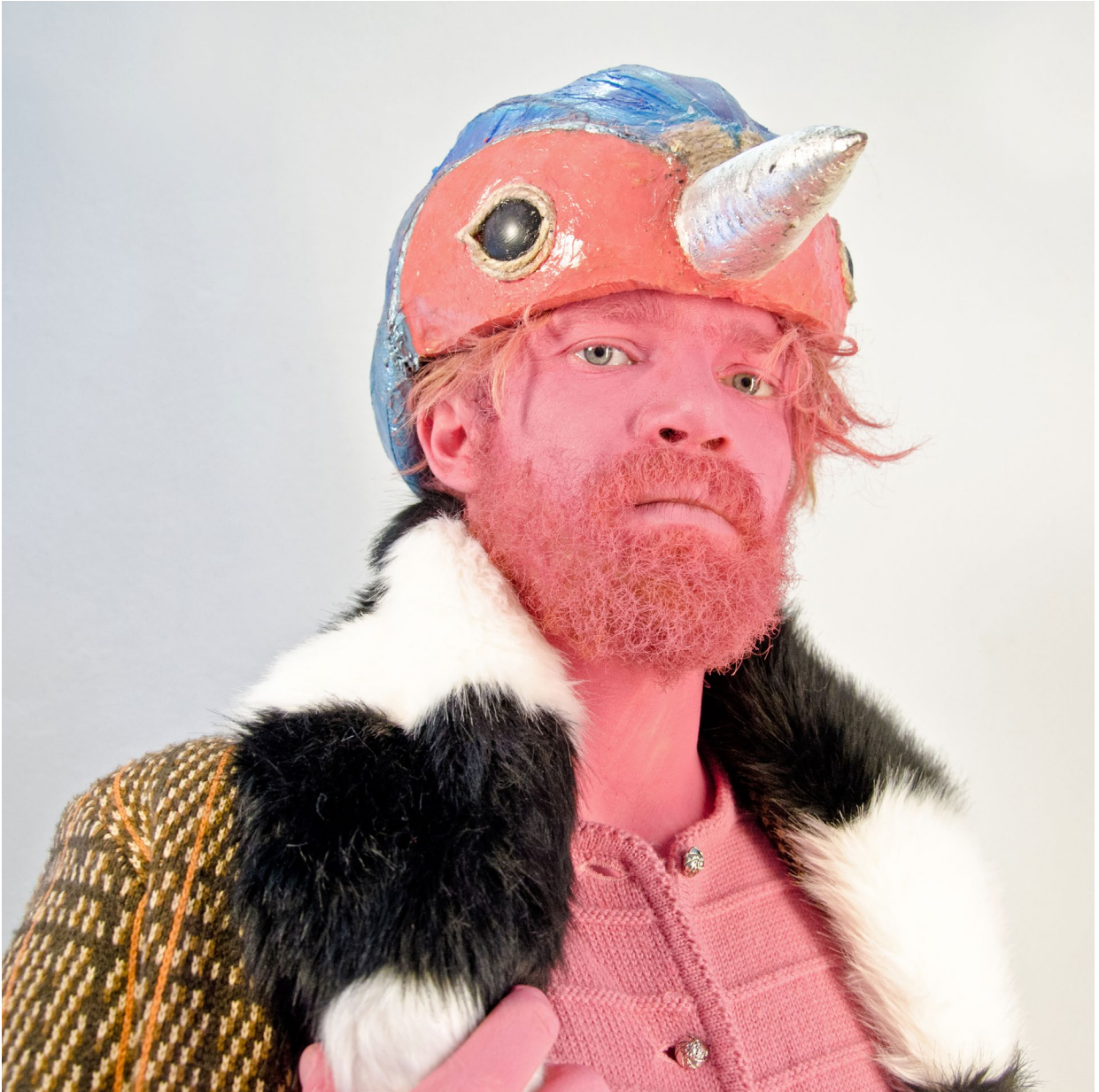
Chaffinch (Portrait) 2019 Photograph, framed 60 x 60 cm