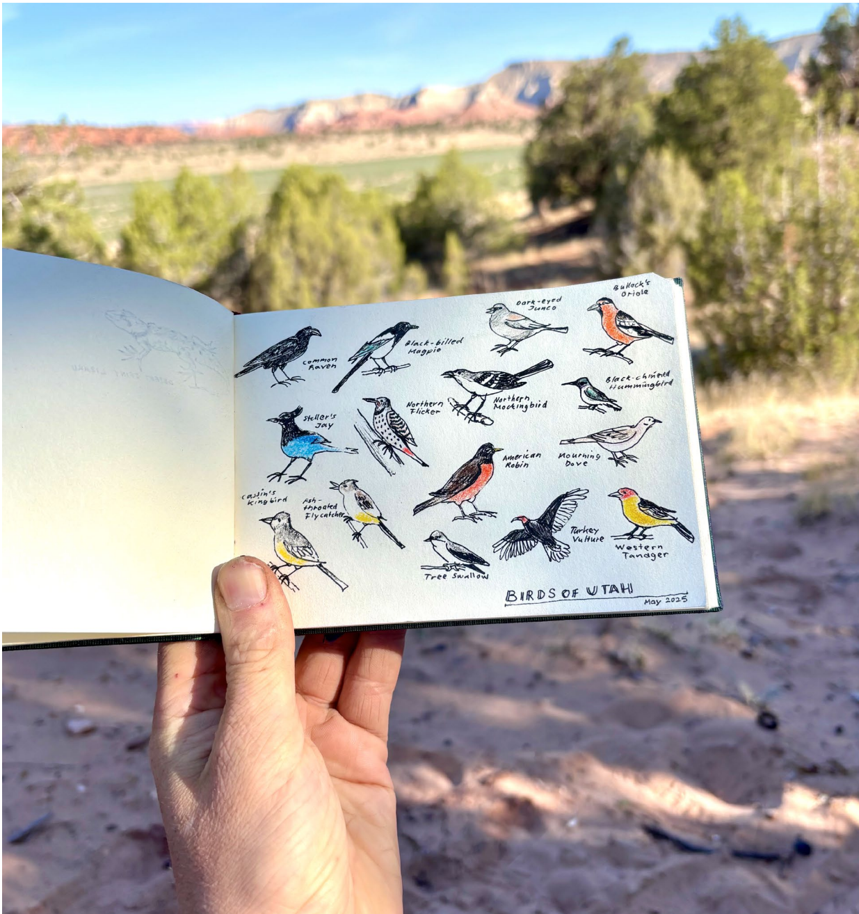
Birds of Utah 2025 Sketchbook drawing