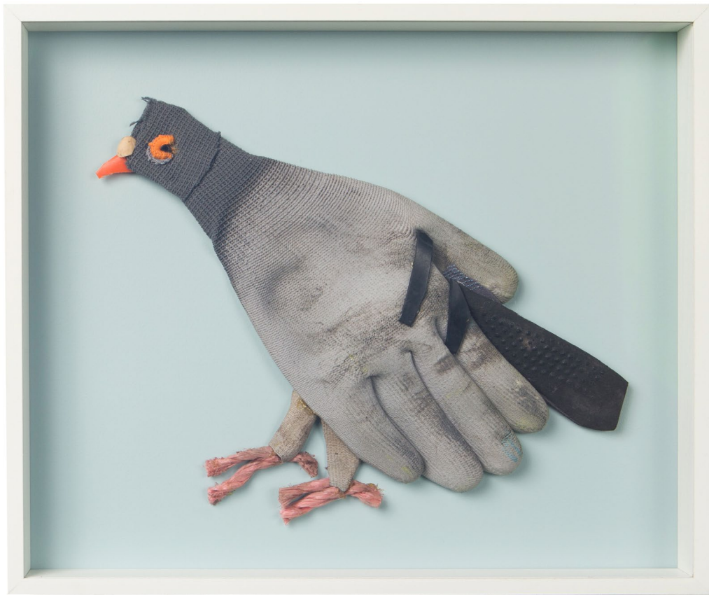
Pigeon IV 2021 Collage in display case 28 x 34 x 4 cm