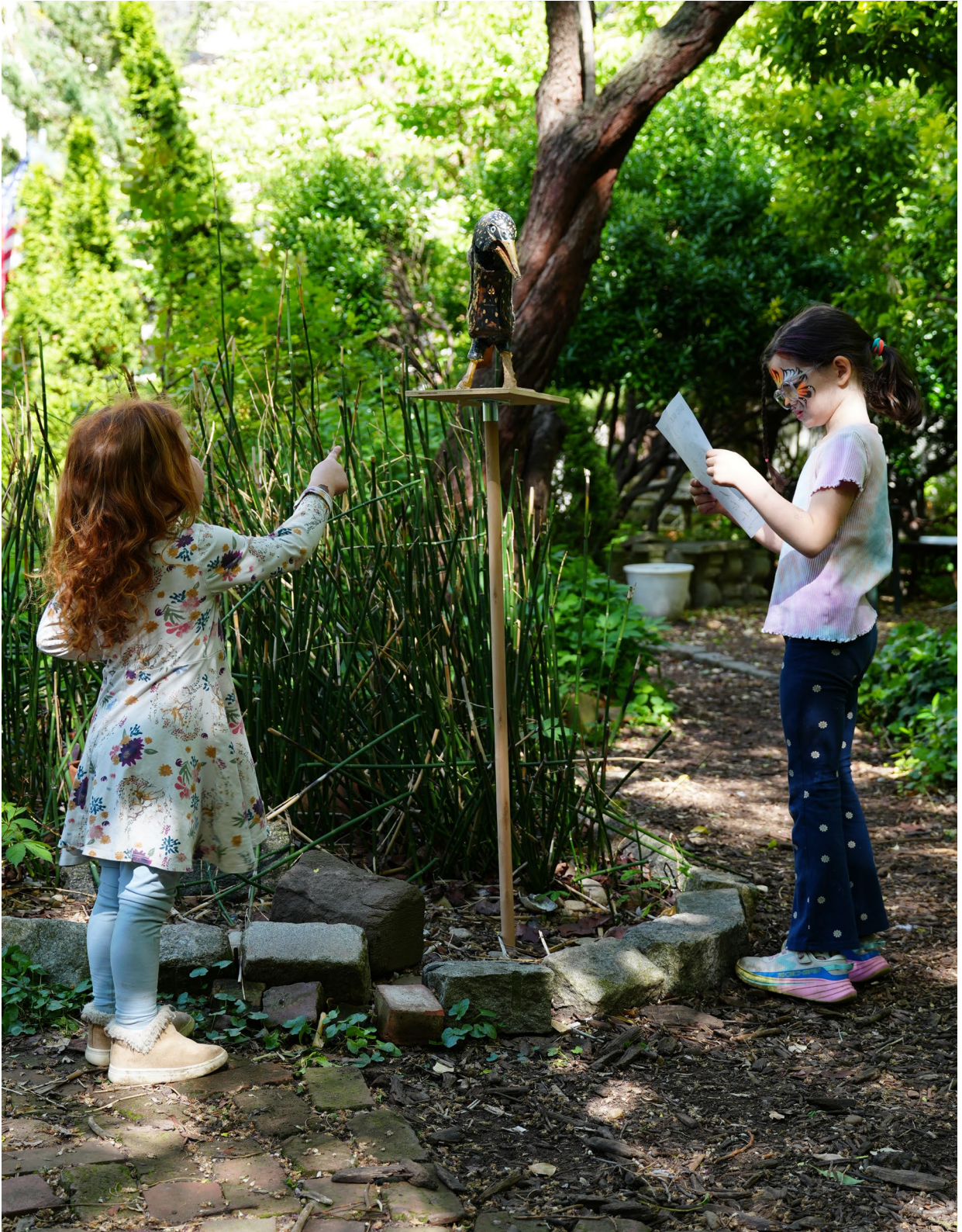
Bird Walk 2026 Participatory installation Francisco "Pancho" Ramos Community Garden, NYC