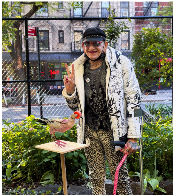
Bird Walk 2025–26 Participatory installation, selected views Various locations, New York City