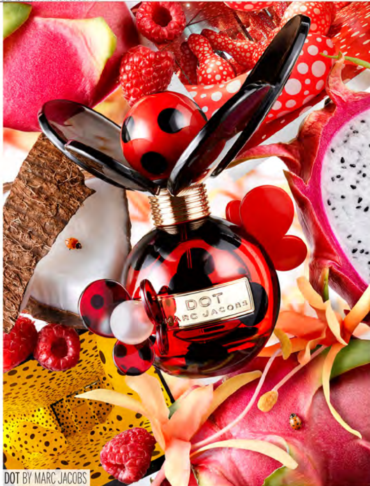
DOT BY MARC JACOBS

Marc Jacobs may, as he says, "love the classic, eternal nature of polka dots," but he doesn't take them too seriously. His new fragrance, Dot, was inspired by works by Yayoi Kusama (1), with whom he recently collaborated for Louis Vuitton, as well as by the "whimsical, irreverent" woman he imagines wearing the scent. The eau's pop art-like composition includes "juicy, playful" raspberry (2), dragonfruit (3), and honeysuckle (4), as well as "energetic" coconut water (5). The flacon, Jacobs says, evokes ladybugs (6) and butterflies: "I wanted it to be quirky."