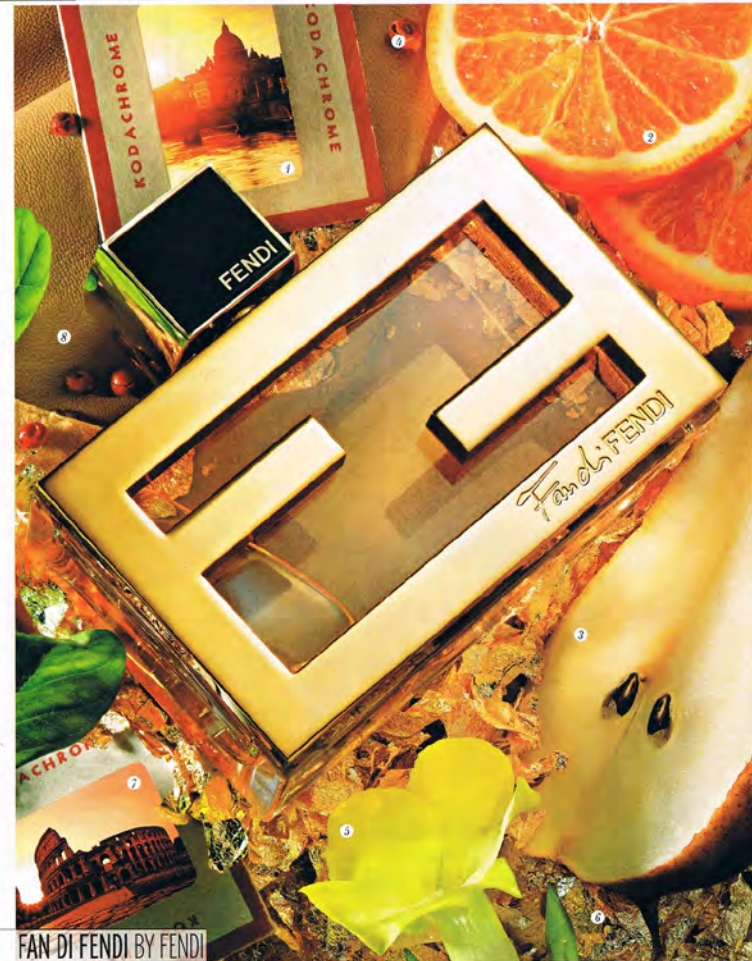
FAN DI FENDI BY FENDI

Ciao bella! The spirit of Rome (1) imbues Fan di Fendi—a fragrance that the Italian luxury label's accessories designer Silvia Venturini Fendi says was conceived "to be as iconic as the Baguette or Peekaboo bag." Bright top notes of tangerine (2), pear (3), and pink peppercorn (4) open up to a blooming central accord of rose and yellow jasmine (5), meant to conjure real gold (6) as well as the golden glow of a sunny day in the Eternal City. Fendi says the patchouli and sensual musk at the scent's base are a nod to the onset of evening (7), "when parties begin," while a unique leather (8) note pays homage to the cashmere-soft materials used to create Fendi's coveted bags.