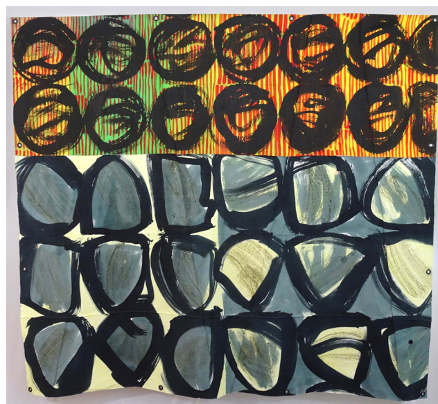
Astrid Bennett (President) Post Japan: Stones (Tarp Series) 2019, hand-painted cotton fabric, dyes, polymer medium, India ink, grommets, monoprinted, screenprinted, stitched, drawn, 68" x 75" x 2". astridhilgerbennett.com