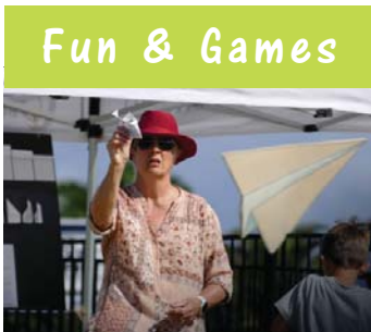
Fun & Games