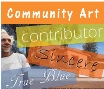
Community Art contributor