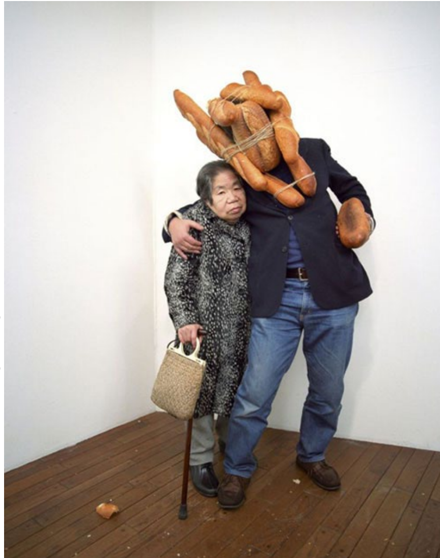
Tatsumi Orimoto „Bread Man Son and Alzheimer’s Disease Mother” (1996)

Contest: Image description based on the reference image.