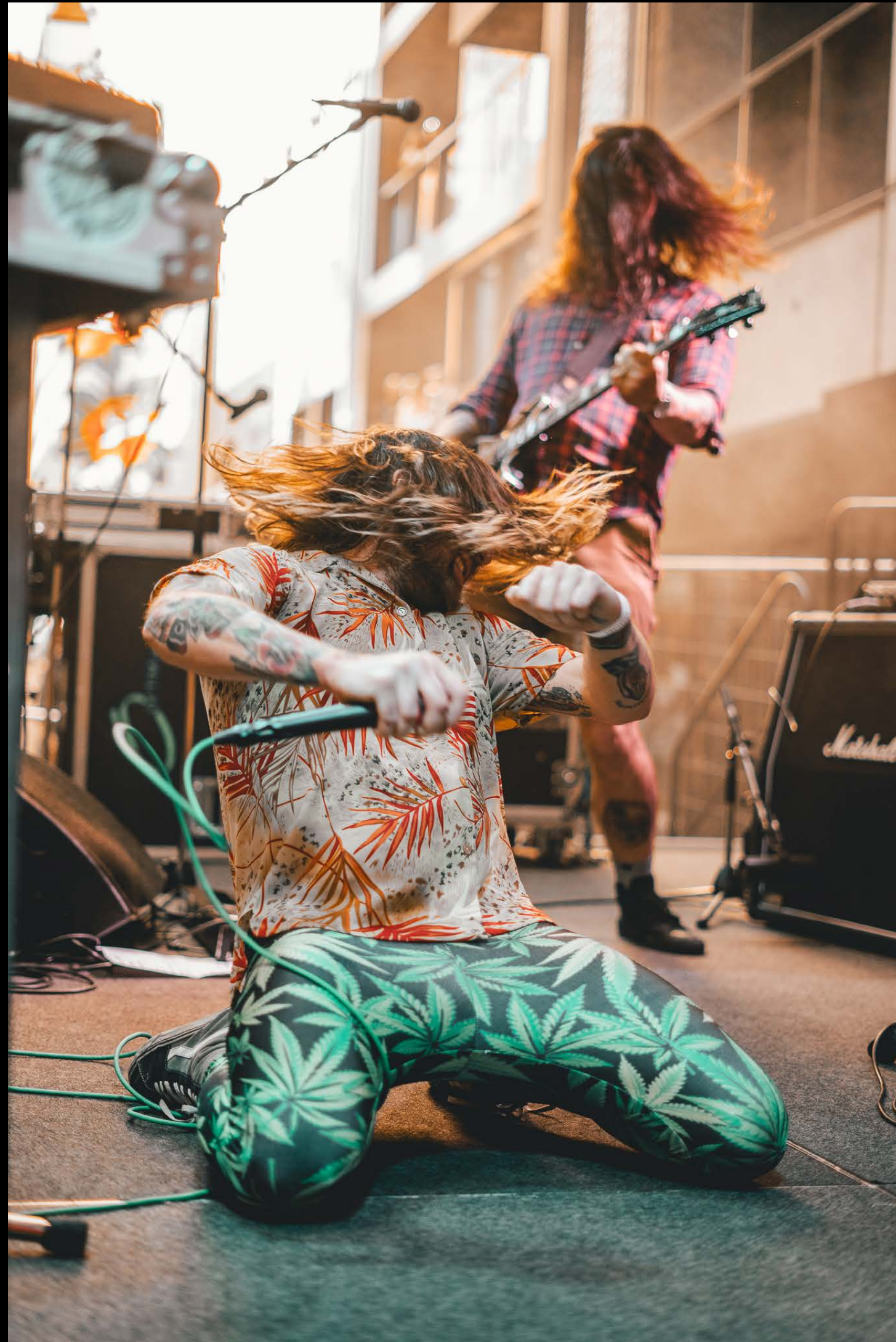
LIVE MUSIC The Bennies