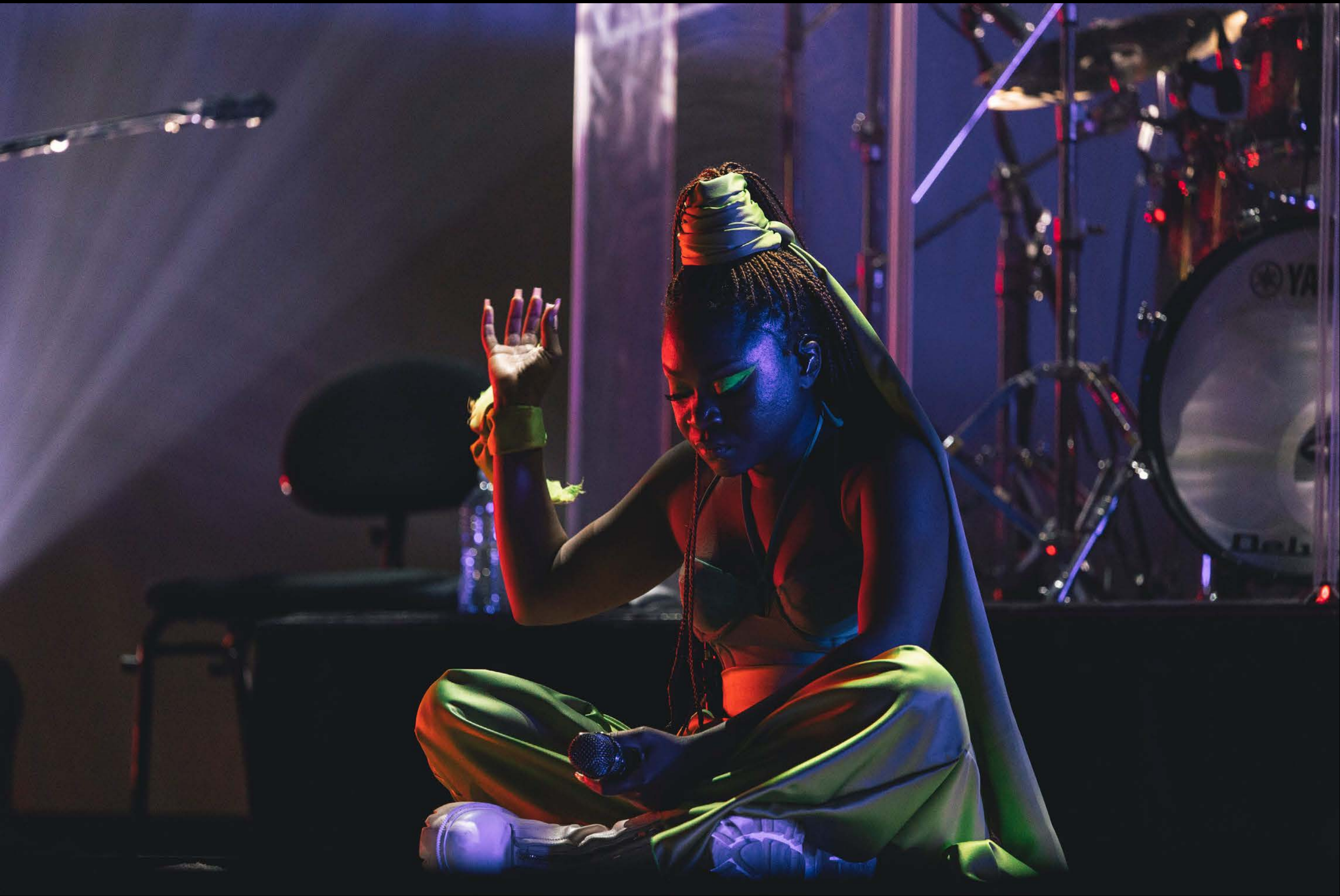
LIVE MUSIC Sampa the Great