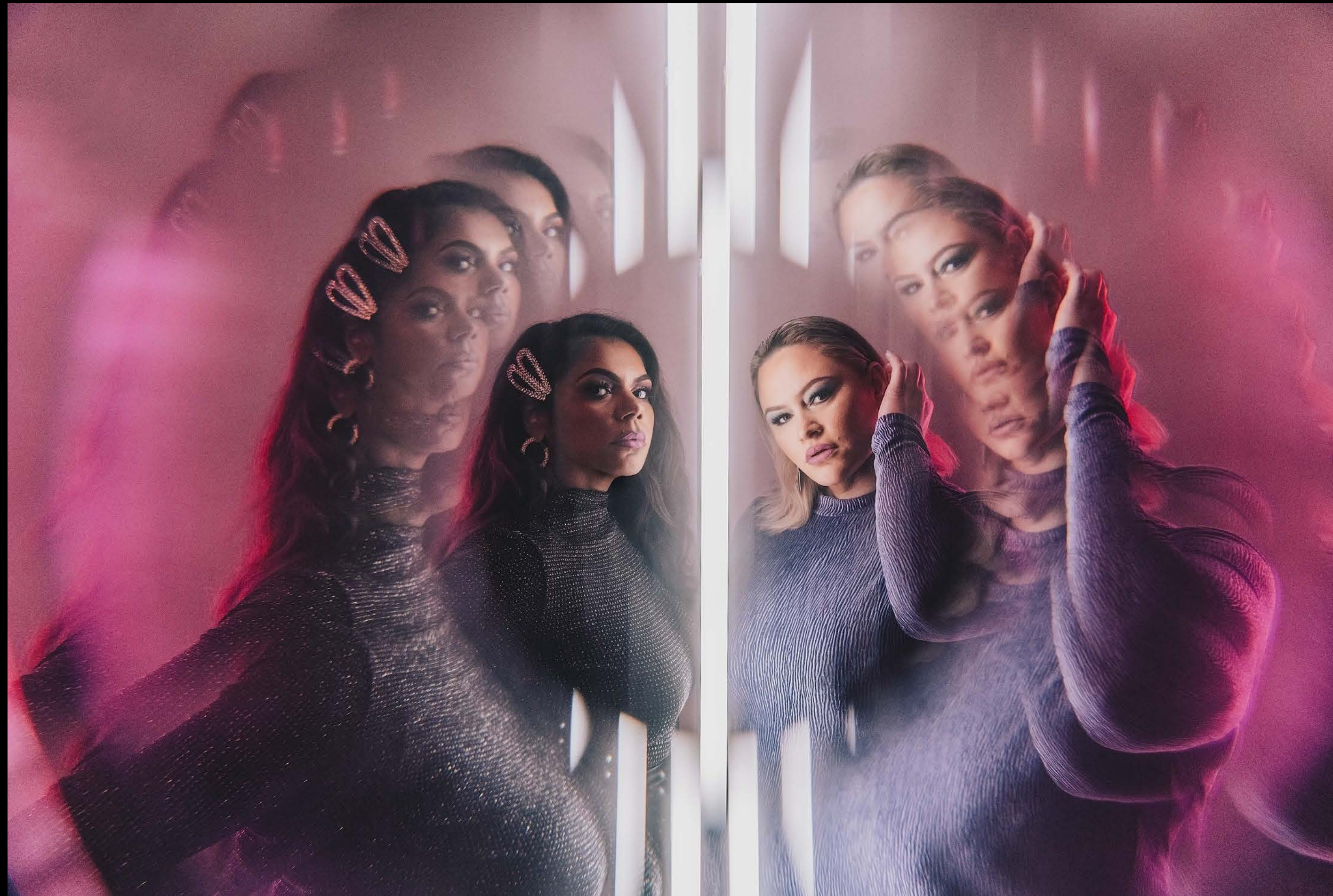
ARTIST PROMOTIONAL The Merindas