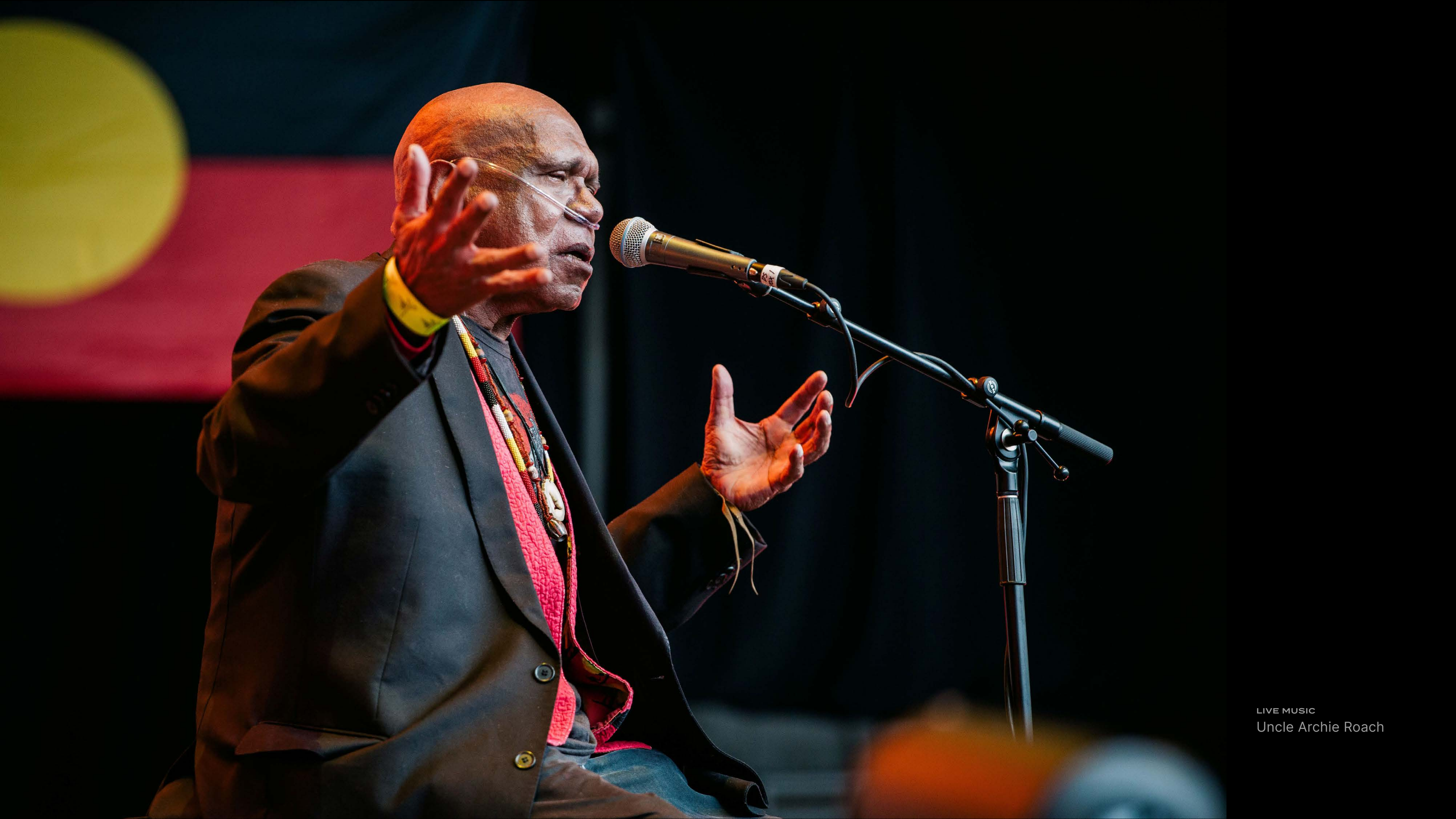
LIVE MUSIC Uncle Archie Roach