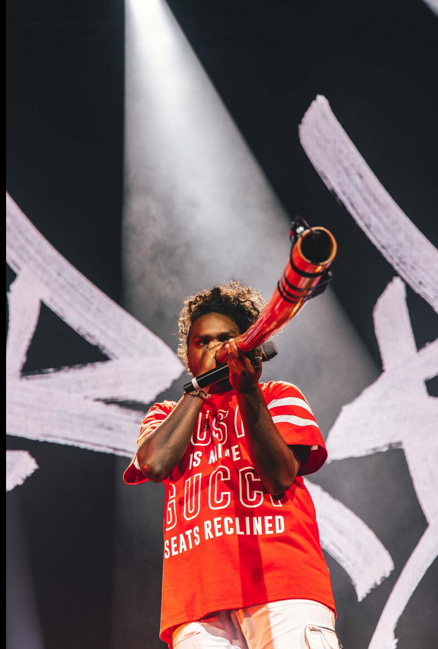
LIVE MUSIC Baker Boy